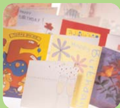
✓ Greetings cards