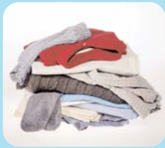
✗ Textiles and shoes/glass