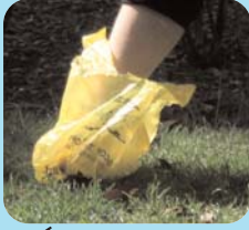
✓ Pet waste