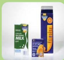
✓ Juice cartons

Please don't put textiles, glass, food waste, garden waste, paint or disposable nappies in the green-lid bin.