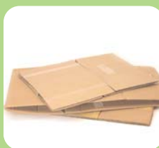
✓ Corrugated cardboard