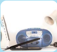
✗ Electronic items