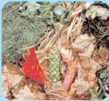
✗ Food and garden waste