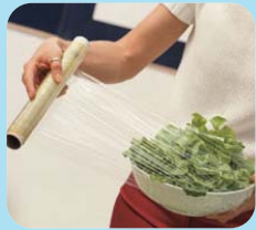
✓ Bubble wrap /cellophane /cling film