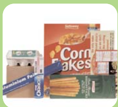
✓ All cardboard packaging