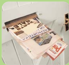
✓ paper/ junk mail