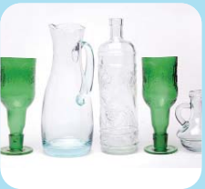
✓ Broken glass (wrapped)