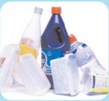
✗ Dry recyclables