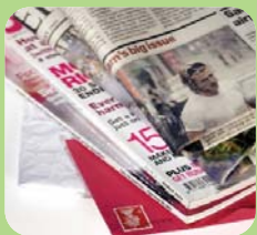
✓ Newspapers/ magazines