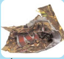
✓ Crisp packets /chocolate wrappers