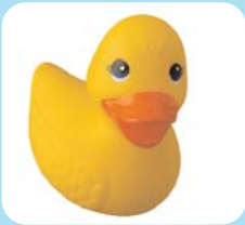
✓ Hard plastic items eg toys