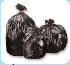
✓ Black sacks