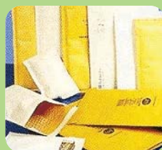
✗ Jiffy bags