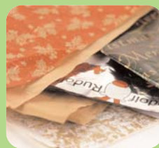
✓ Wrapping paper