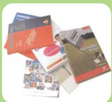
✓ Catalogues/ directories