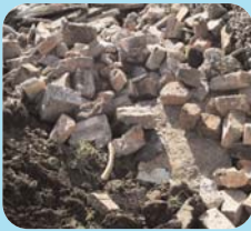
✗ Building rubble/paint/ oil tins