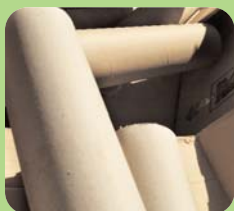
✓ Kitchen/ toilet roll tubes