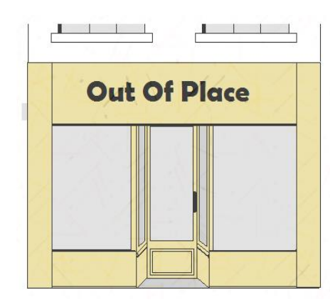
Figure 1: Example of inappropriate signage with an excessively deep fascia sign, and lack of adequate spacing between the shopfront and first floor windows.