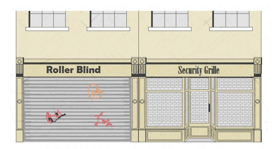
Figure 5: The roller blind on the left, obscures visibility into the shop, which compromises security and is a target for graffiti. The security grille on the right is more sympathetic to the traditional character of the shopfront, and enables visibility into the premises