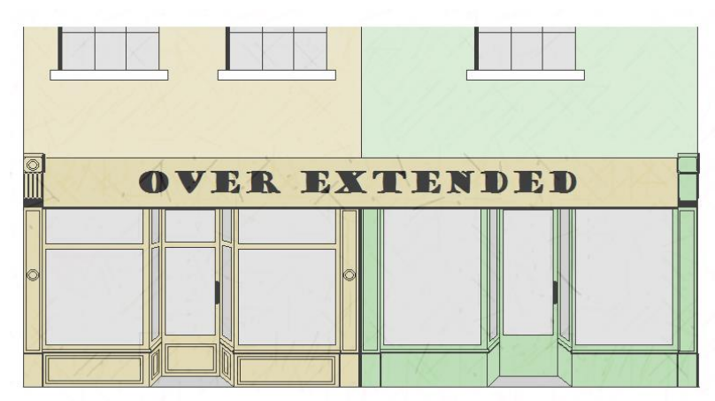
Figure 3: Example where signage has been extended over two units, and appears out of proportion with the host buildings, and obscuring the individual character of each unit.