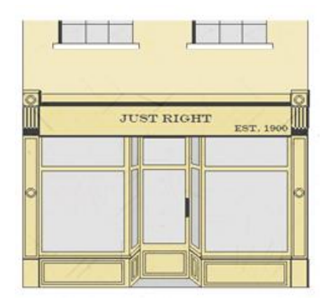
Figure 2: Example of traditional shopfront. The lettering is sympathetic in its font and size and in proportion to the depth of the fascia.