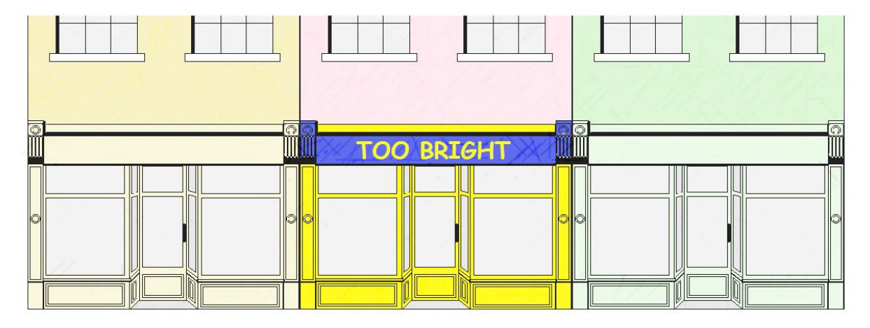
Figure 4: Example where middle shopfront is out of keeping with the wider terrace, and detracts from the character and appearance due to unsympathetic colour choice.