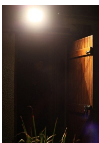
Light angled correctly Light angled incorrectly

Make sure your light shines only where needed: a light angled downwards can be more effective than one angled outwards.