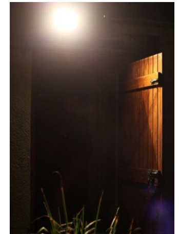
Light angled correctly Light angled incorrectly

Make sure your light shines only where needed: a light angled downwards can be more effective than one angled outwards.