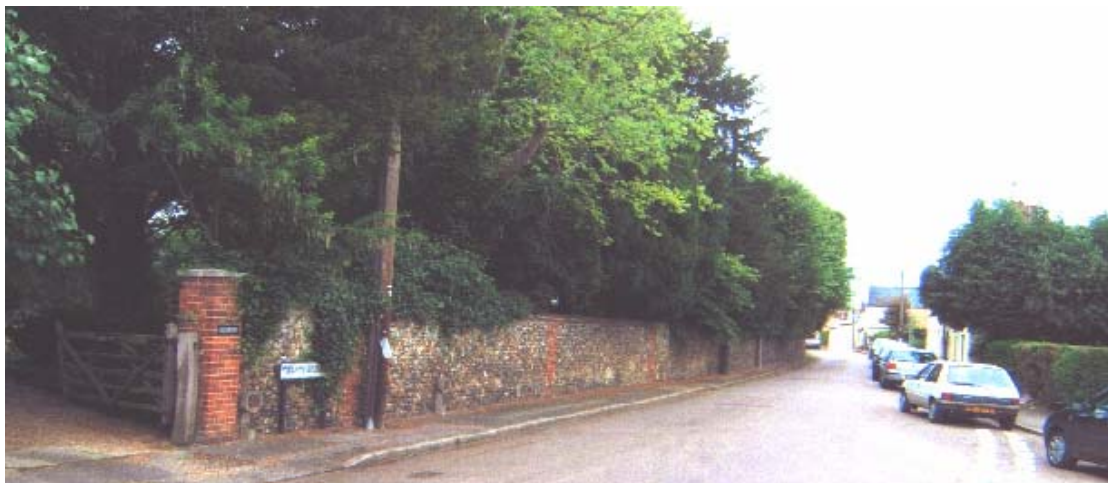
Sector 5b Carmon Street frontage and boundary wall to The Delles.