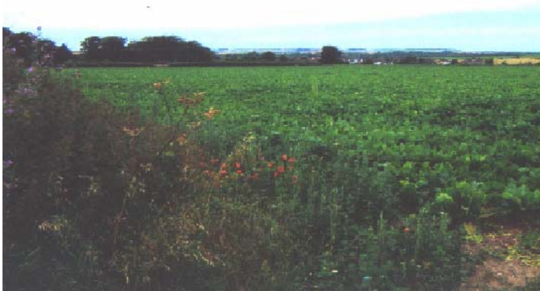
Sector 1 looking west from Cow Lane

Broad statement of effect of development. Development on Sector 1 land would impact on that part of the historic core at its north eastern extremity where High Street meets the B184. Elsewhere it would not, due to the presence of extensive 20 th century development that separates this sector from the historic core. The principal effect of large scale development would be to extend the village beyond clearly defined landscape features thus detrimentally affecting its setting and onto open arable farmland resulting in the loss of agricultural land. It is considered that development in this sector would diminish the sense of place and local distinctiveness of the settlement.