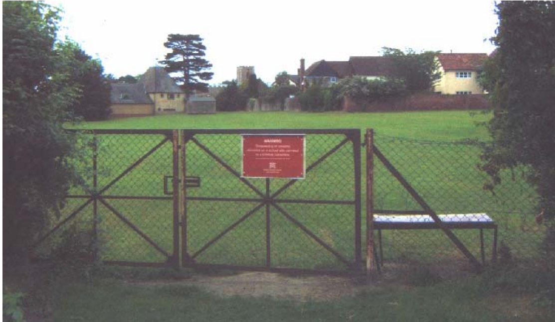
Sector 5c looking south across playing field towards church tower.

space and marring views of the important landmark building, All Saints church. It is considered that development in this sector would be damaging and would diminish the sense of place and local distinctiveness of the settlement.