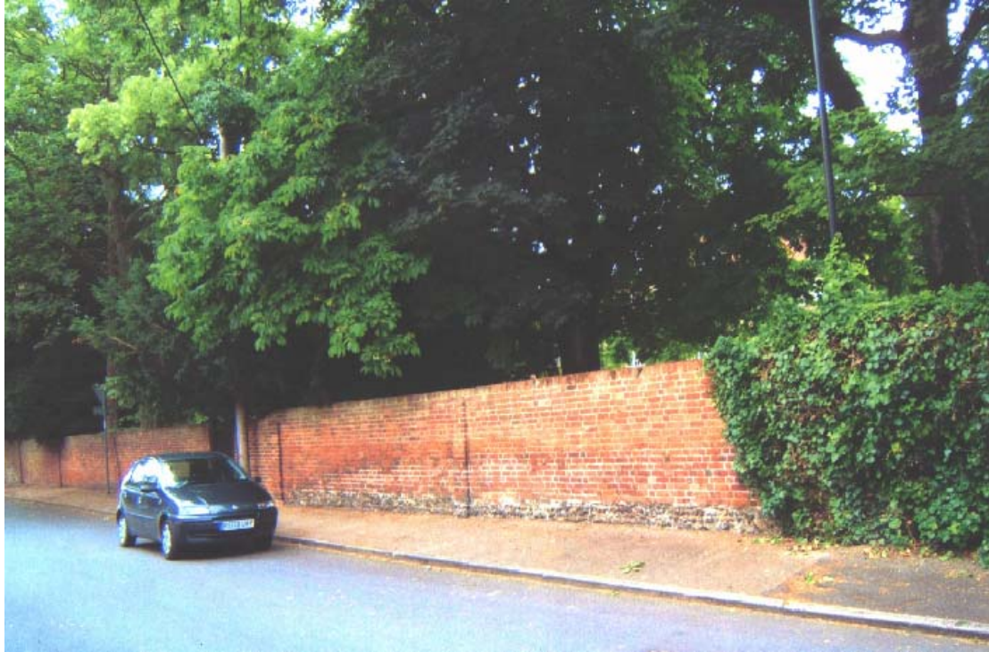
Sector 5a Chesterford House boundary to High Street.