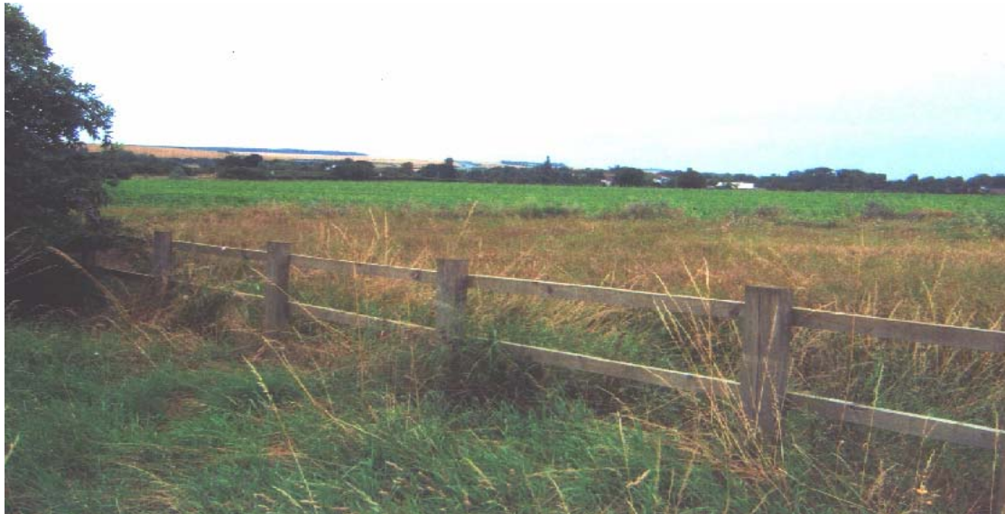
Sector 2 Newmarket Road approach, looking south towards the edge of the village.

Broad statement of effect of development. Development on Sector 2 land would impact on that part of the historic core at its western extremity to the west of Newmarket Road. Elsewhere it would not. The principal effect of large scale development would be to extend the village beyond clearly defined landscape features thus detrimentally affecting its setting and this approach by intruding onto open arable farmland with its consequential loss. Additionally development would affect important Scheduled Ancient Monument sites and their settings in selected locations to the west of Newmarket Road. It is considered that development in this sector would diminish the sense of place and local distinctiveness of the settlement.