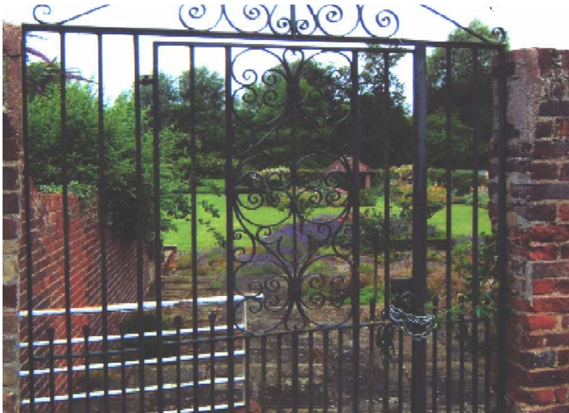
Sector 5e Brook House garden from Manor Lane.