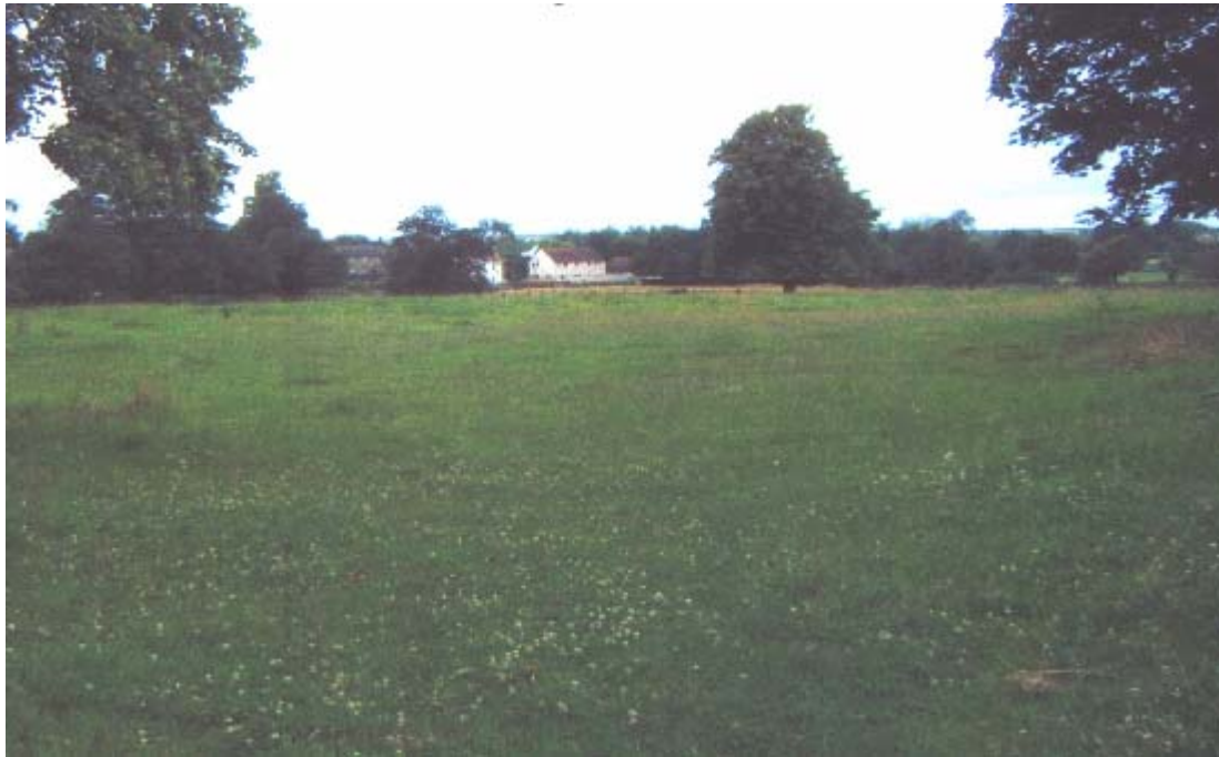
Sector 5b land south of Meadow Road looking across parkland in north west direction.