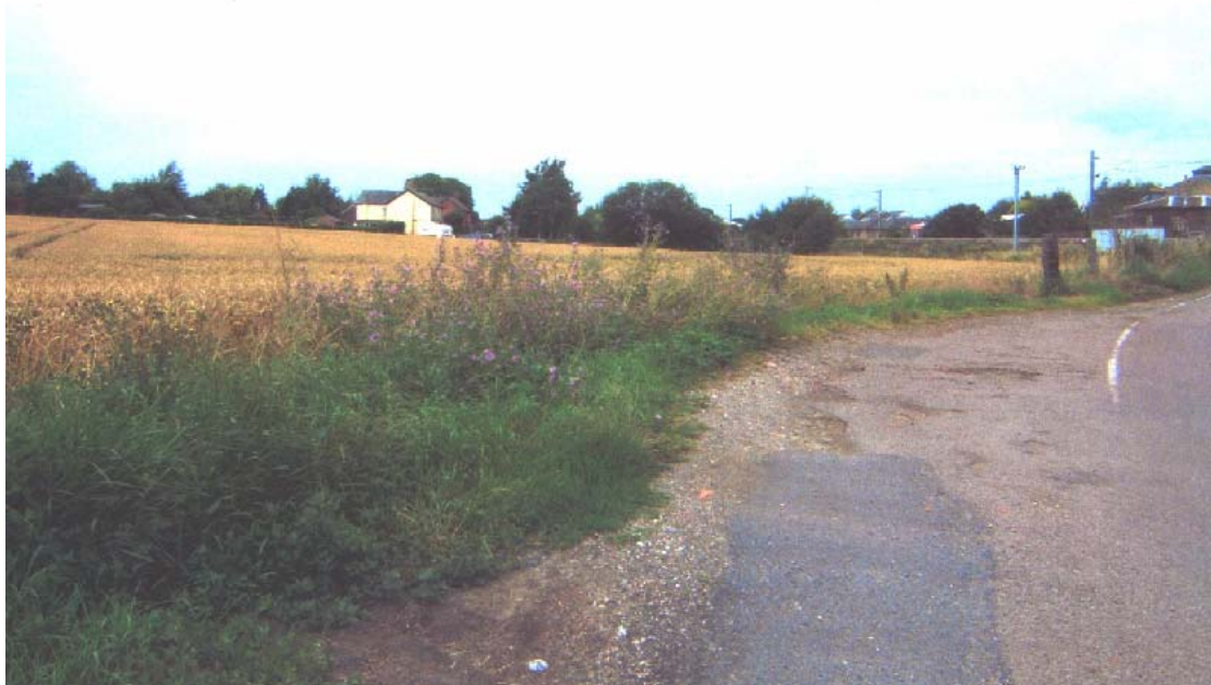
Sector 3 looking east from Ickleton Road towards the edge of the village.

by the railway and the adjacent commercial development. The principal effect of large scale development would be to extend the village beyond clearly defined landscape features formed by the railway resulting in the loss of agricultural land. It is considered that development in this sector would diminish the sense of place and local distinctiveness of the settlement.