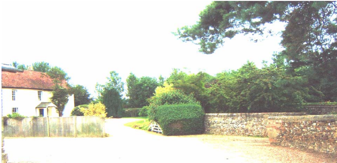
Sector 5e curtilage of Manor Farm.