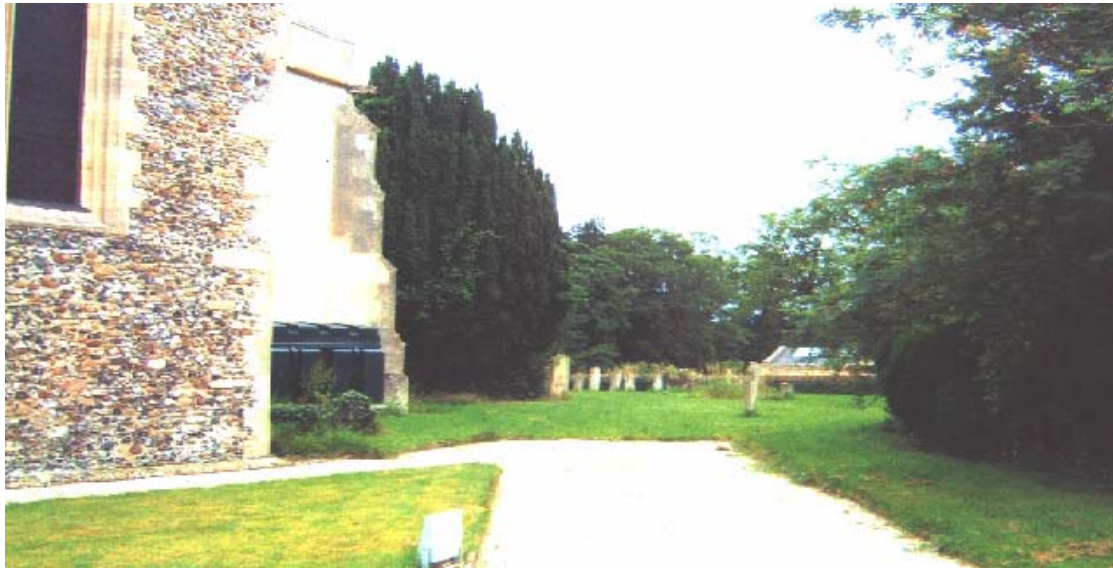
Sector 5d looking south west through churchyard towards curtilage of Bishops House.