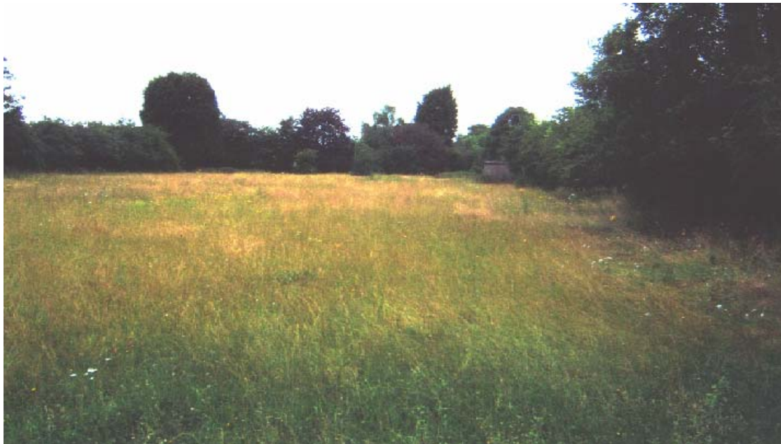
Sector 6 land to the south east of Stanley Road and Four Acres.

Broad statement of effect of development. Subject to the retention of the important hedge boundaries, both peripheral and internal, and retention of some of the land for public access being made available to nearby residents for recreational purposes and subject to high quality design and respect for the adjoining Conservation area to the south, appropriate small scale residential development could be created that at worst would be neutral and at best would improve the sense of place and local distinctiveness of the settlement.