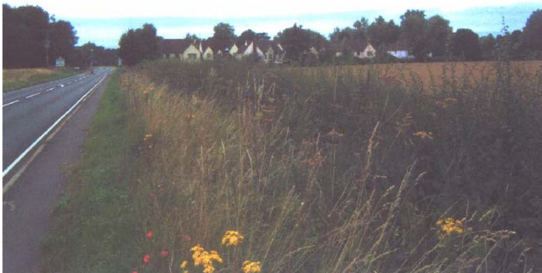
Sector 4 Newmarket Road approach from the south east looking towards the edge of the village.