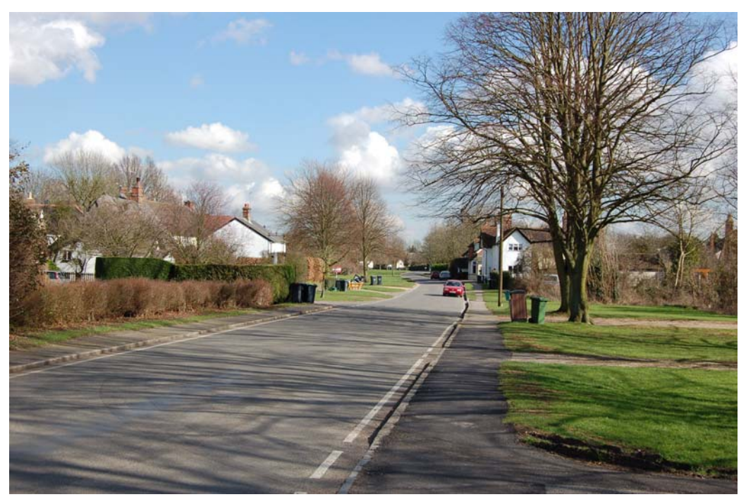
Sector 6a Verges bordering High Street

Broad statement of effect of development. Development here would detrimentally impact on the historic core and represent a substantial loss of character and amenity. It is considered that development in this sector would be highly damaging and significantly diminish the sense of place and local distinctiveness of the settlement.