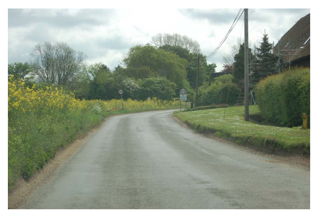
Sector 1 view from Old Mead Road