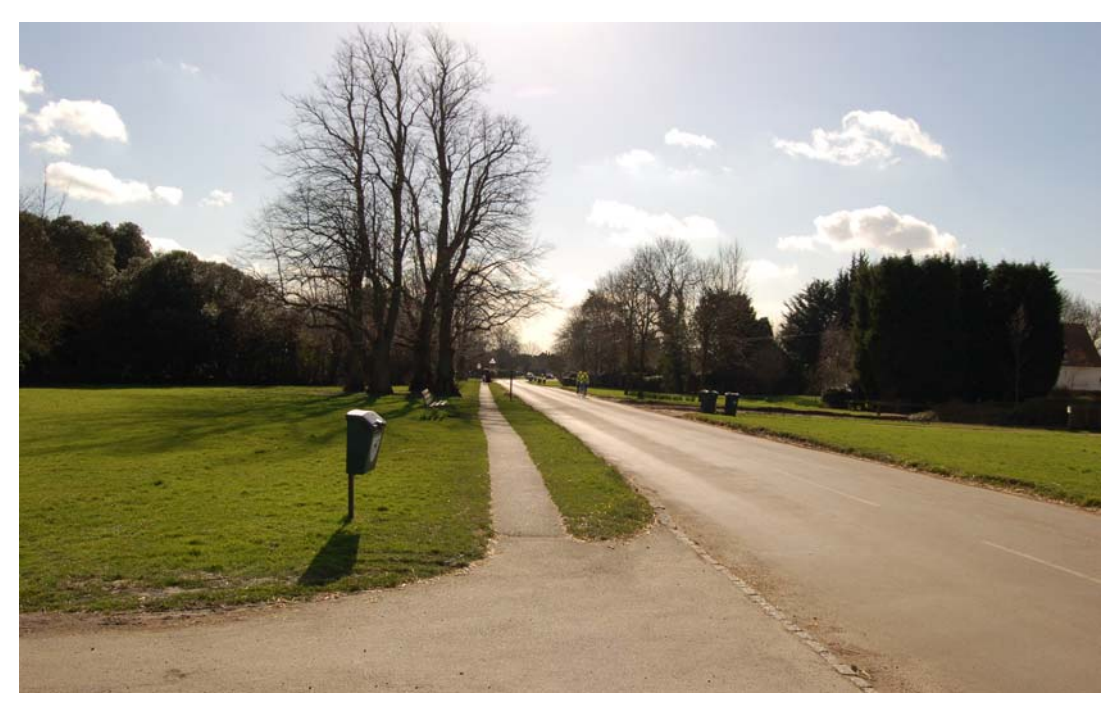
Sector 6b Verges bordering Crow Street

this sector would be highly damaging and significantly diminish the sense of place and local distinctiveness of the settlement.