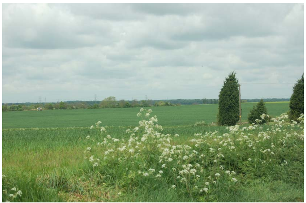
Sector 2 Distant view from Mill Road to the M11