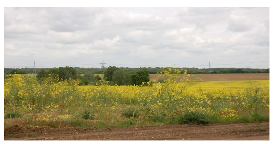
Sector 1 view from Henham reservoir to the M11

Broad statement of effect of development. Development on Sector 1 land would impact on that part of the historic core at its north western extremity where Old Mead Road becomes Church Street. This is an area of great sensitivity where quality historic properties, including St. Mary's Church and Birds Farm directly abut open countryside Elsewhere the effects of development would be mostly mitigated by the buffering effect of twentieth century development that separates the open countryside from the historically sensitive Crow Street. The principal effect of large scale development would be to extend the village beyond clearly defined landscape features thus detrimentally affecting its setting and onto open arable farmland resulting in the loss of agricultural land. It is considered that development in this sector would considerably diminish the sense of place and local distinctiveness of the settlement.