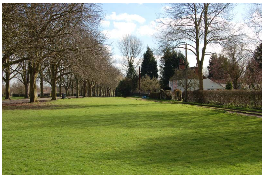
Sector 6e Woodend Green

Broad statement of effect of development. Development here would detrimentally impact on the historic core resulting in the loss of fine open spaces and trees that support a varied ecological system. It is considered that development in this sector would be damaging and diminish the sense of place and local distinctiveness of the settlement.