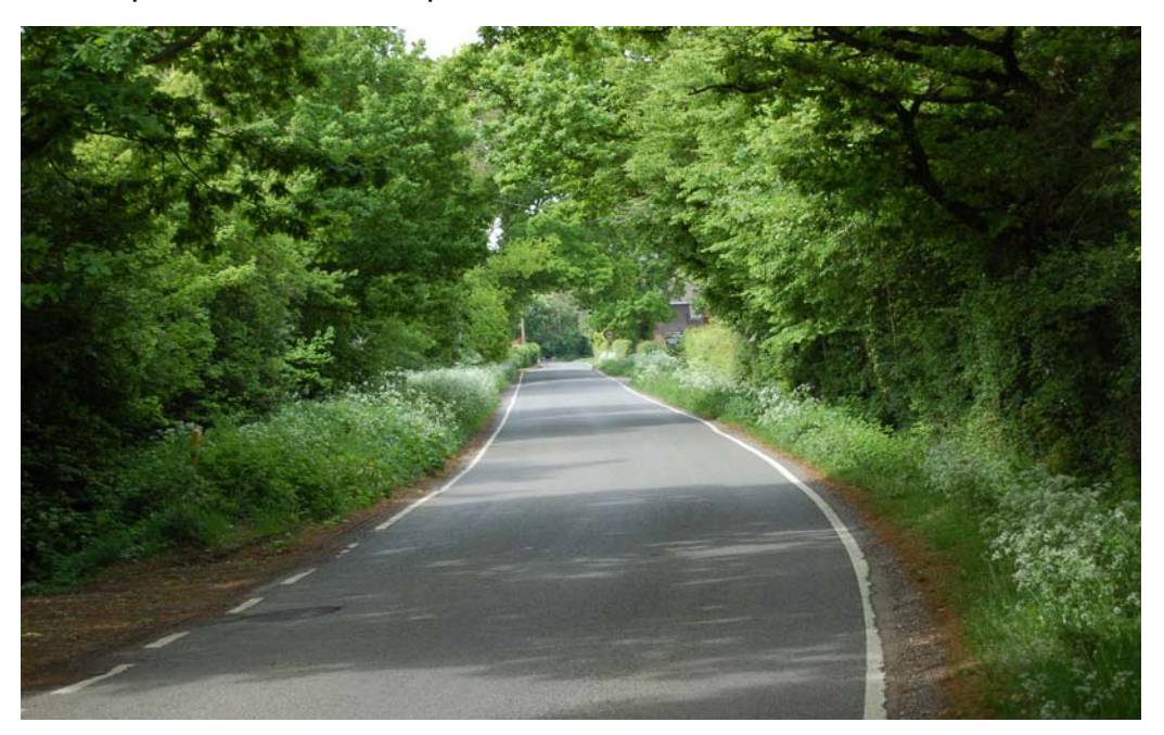
Sector 5 view Chickney Road approach from the east

Broad statement of effect of development. Development on Sector 4 land would not impact on the historic core to any appreciable extent because the latter is largely shielded from view by modern edge of village development and tree cover. The principal effect of large scale development would be to extend the village beyond its clearly defined landscape edge detrimentally affecting the setting of the village as a whole and resulting in the loss of agricultural land. However, subject to the retention of the important hedge boundaries and subject to high quality design and respect for the adjoining Conservation Area to the west, appropriate small scale residential development could be created that at worst would be neutral and at best would improve the sense of place and local distinctiveness of the settlement.