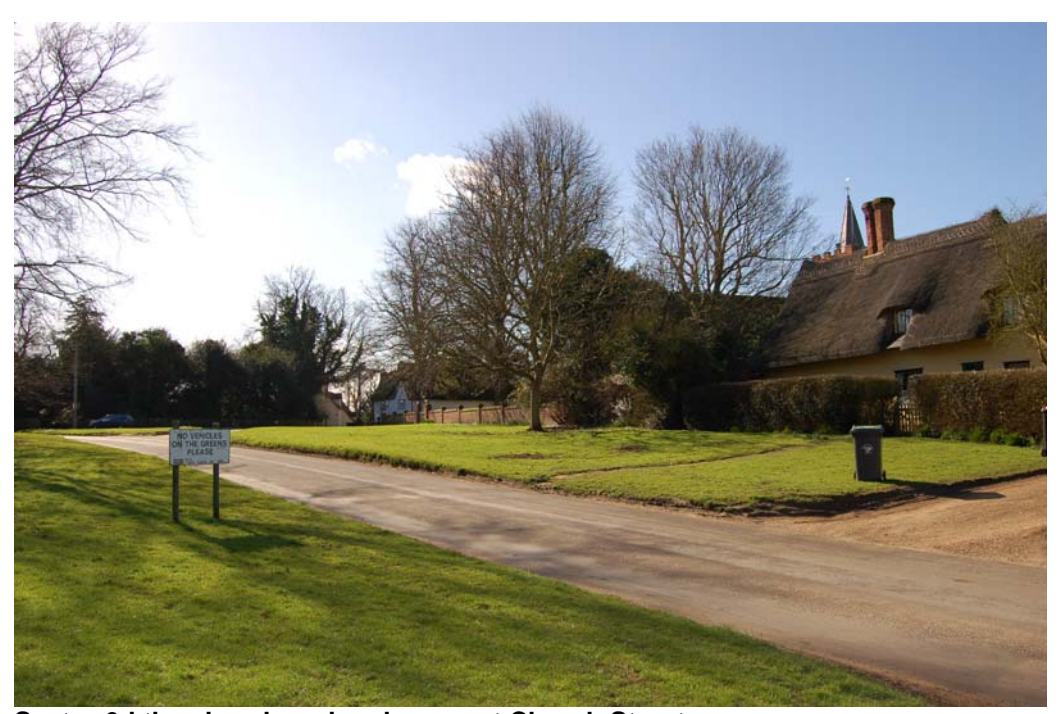
Sector 6d the churchyard and green at Church Street

Broad statement of effect of development. Development here would exert a seriously detrimental effect on the historic core and would lead to considerable loss of open space and trees which support a varied ecological system and serve to define this area of the village. It is considered that development in this sector would be highly damaging and significantly diminish the sense of place and local distinctiveness of the settlement.