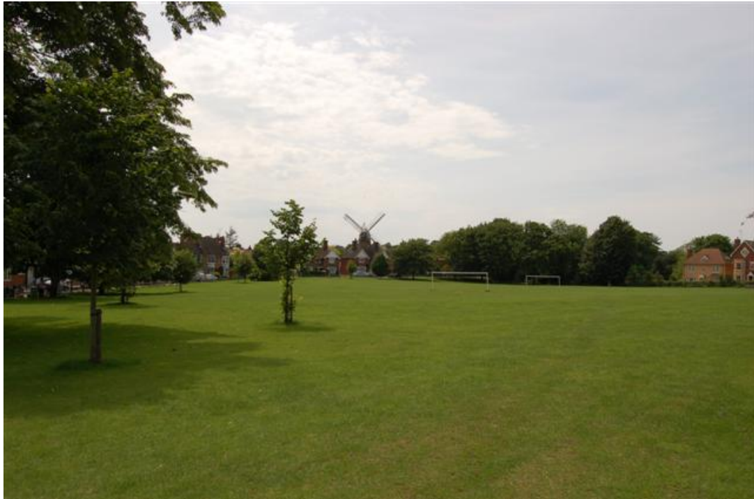
Sector 5a Recreation ground.