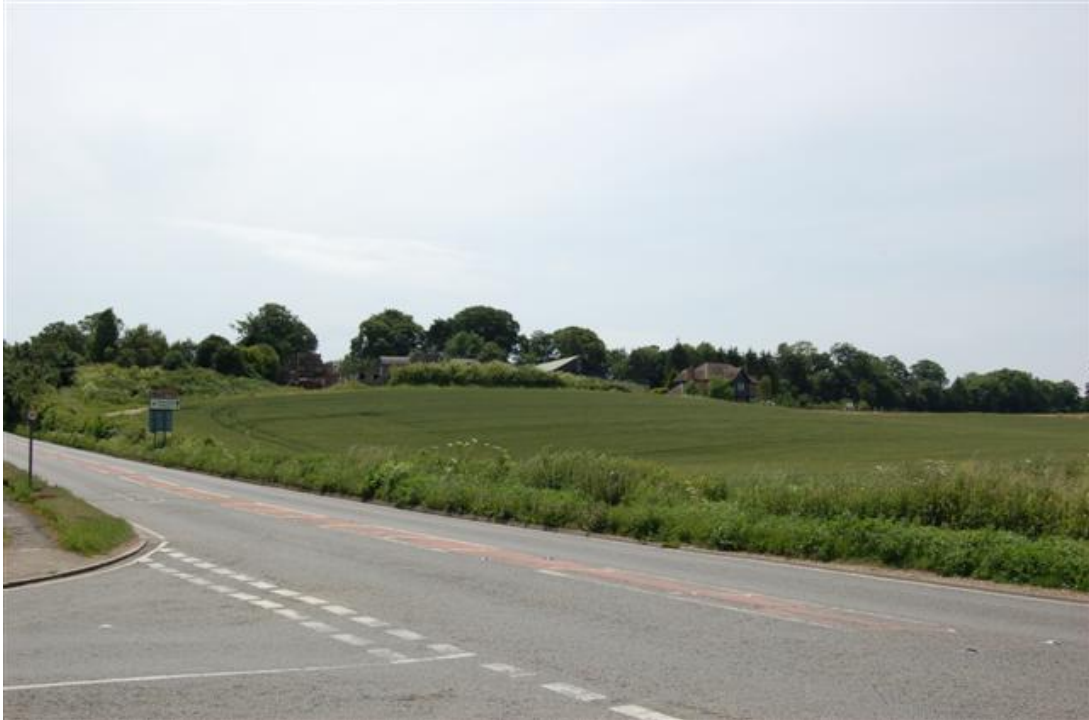
Sector 7 approach from Saffron Walden.