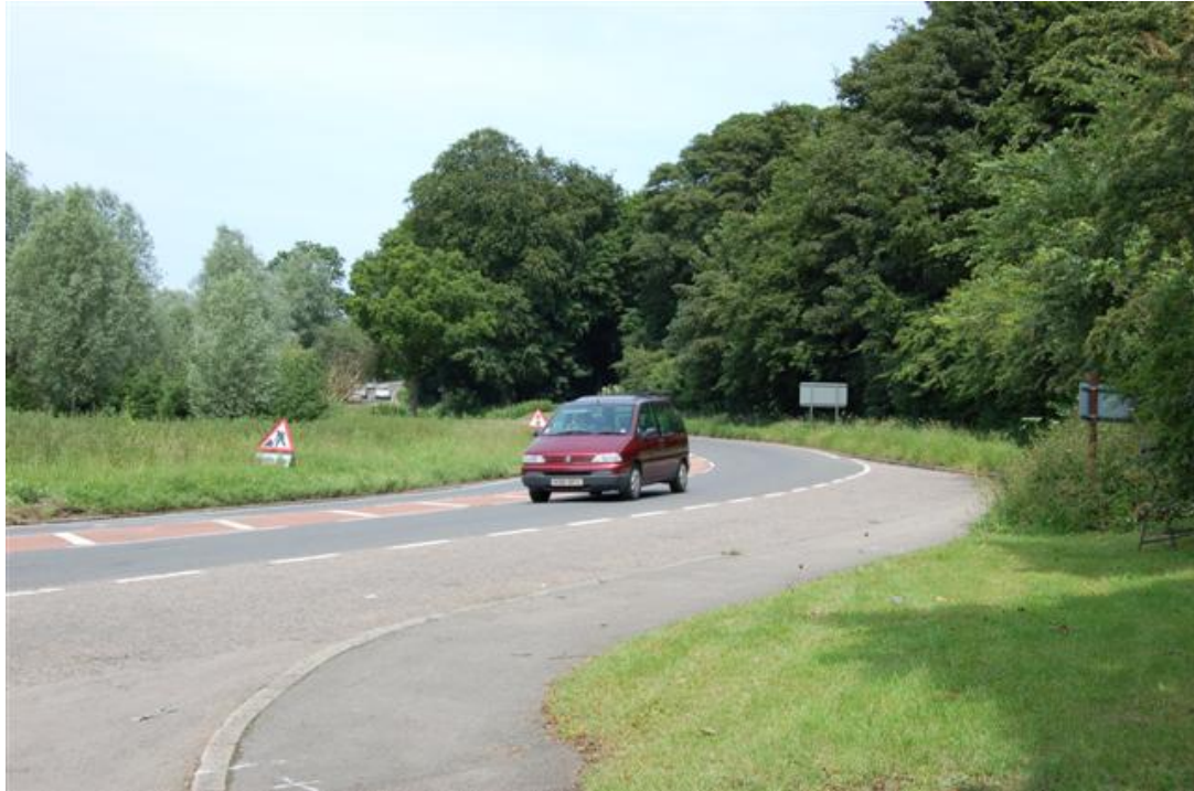
ector 4 approach from Bishops Stortford.

Sector 5. Selected open spaces within the built up area. Some of these sites are in public ownership where the likelihood of development is slight to non-existent. Nevertheless their qualities, functions and the effect of development have been considered so as to present a complete assessment.