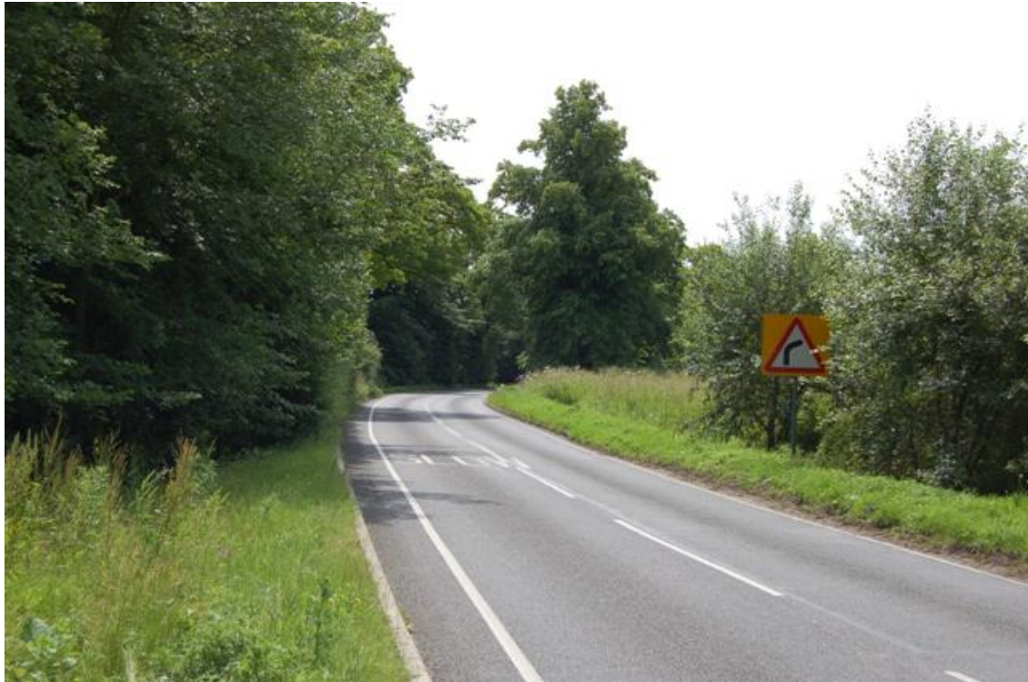
Sector 9 Elsenham Road approach.