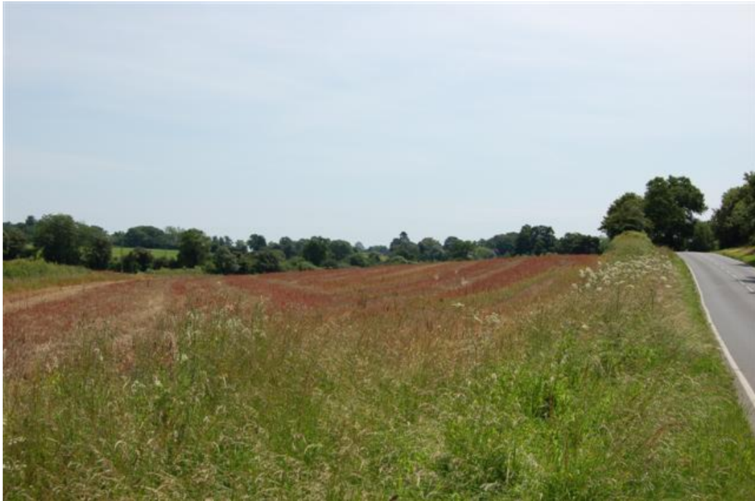
Sector 8 High Lane landscape.