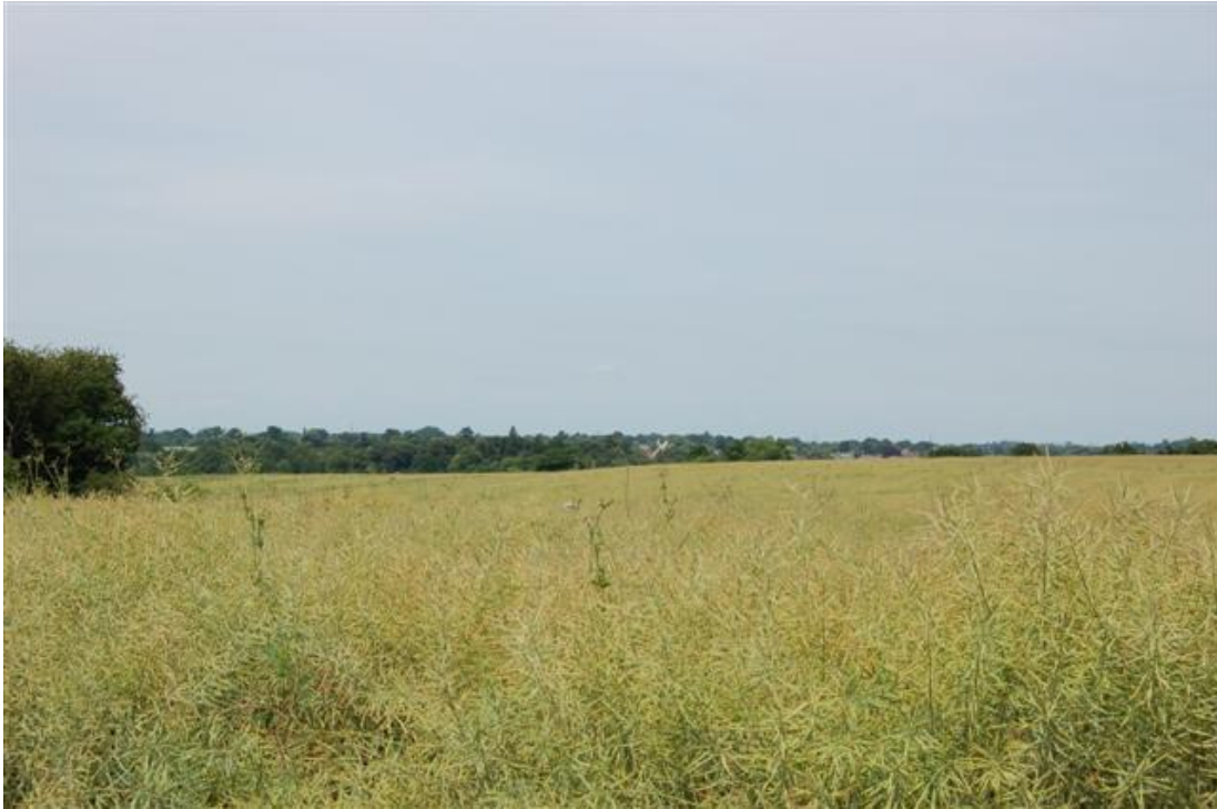
Sector 2 Birchanger looking towards Stansted.

In summary it is considered development in this sector would very significantly diminish the sense of place and local distinctiveness of both the settlements of Stansted Mountfitchet and Birchanger. .