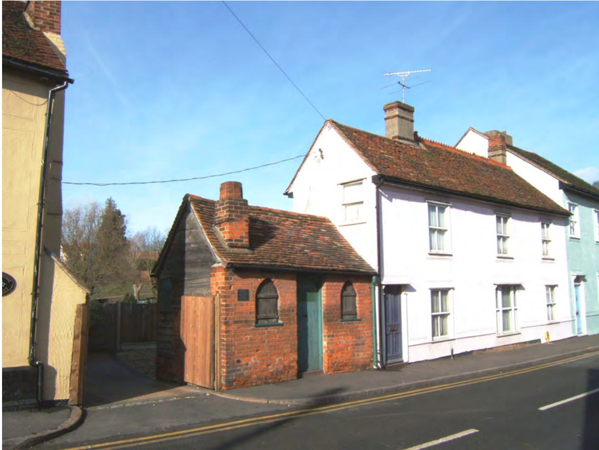
Picture 1.4 13 North Street, a distinctive Grade II listed building, formerly a single cell lock up

1.64 Other buildings that make an important architectural or historic contribution to the conservation area. There is a significant range of buildings principally from the 19th century that add considerable richness to this area both in terms of architectural quality and historic interest. These are briefly described below.