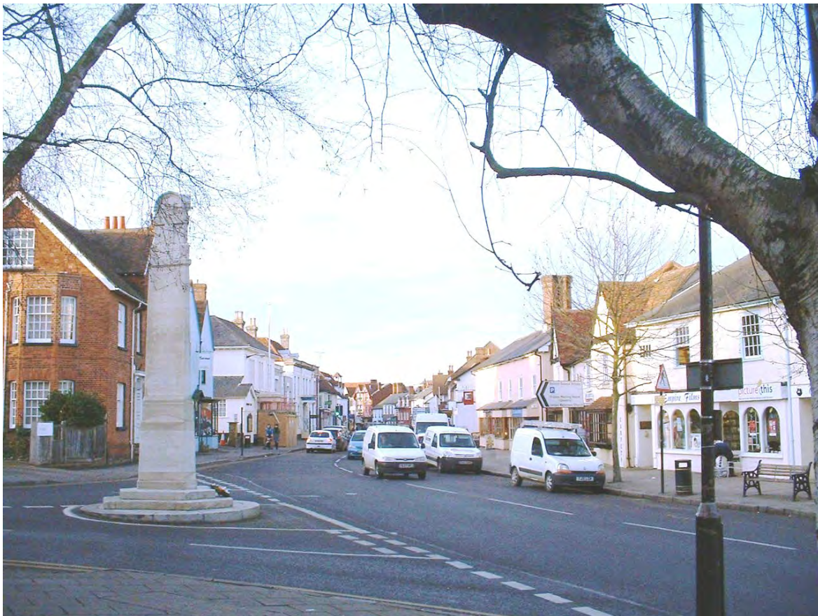
Picture 1.11 The War Memorial, a distinctive feature in the town centre

1.114 The War Memorial on the High Street/ New Street junction is a landmark feature of historical and cultural significance. It commemorates those who died in both wars. Some lettering is beginning to deteriorate and may need attention if the some of the names commemorated are to remain legible.