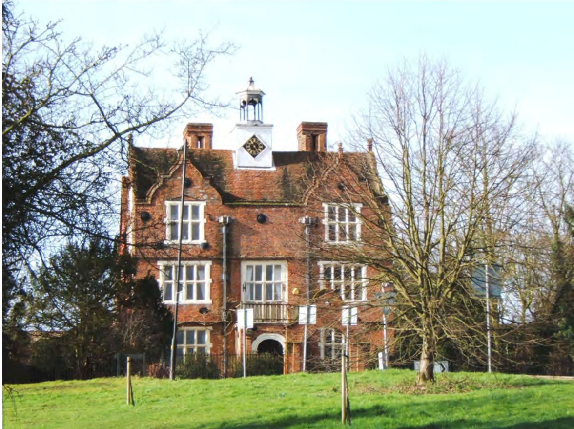
Picture 1.15 Clock House, Beaumont Hill, listed Grade I

1.134 Other buildings that make an important architectural or historical contribution to the conservation area. The buildings briefly described below make an important contribution to the character of the locality.