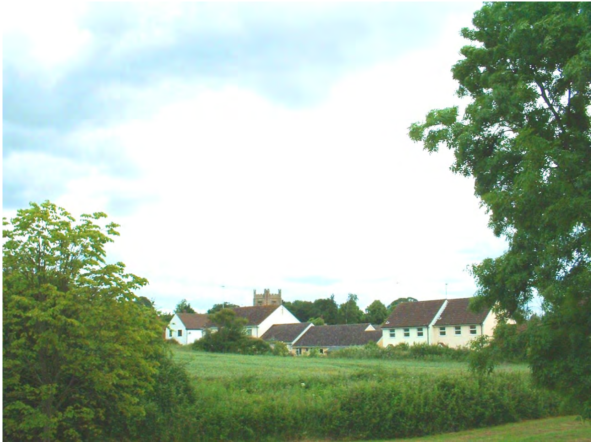
Picture 1.18 Church End and the important gap of farmland separating it from the rest of the town. The modern development detracts.

1.160 Other distinctive features that make an important visual or historic contribution. There are some railings that make such a contribution and these are shown on Figure 4. The railings forming part of the river crossing fall into this category and are in need of repair and repainting.