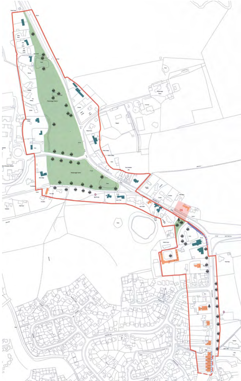
Figure 3.3 Area 2

Reproduced from the Ordnance Survey Mapping with the Permission of the Controller of Her Majesty's Stationary Office. Crown Copyright. Unauthorised reproduction infringes Crown Copyright and may lead to prosecution or civil proceedings. Uttlesford District Council Licence No: 1000018688(2006)