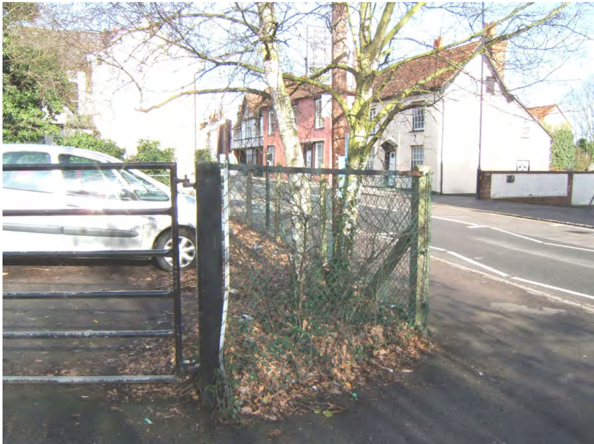
Picture 1.12 Detracting fence at the Library and Youth Centre

1.115 Detracting elements. Poor quality plastic mesh boundary fencing and a profusion of unattractive signs on the Youth Centre seriously detract from this important building.