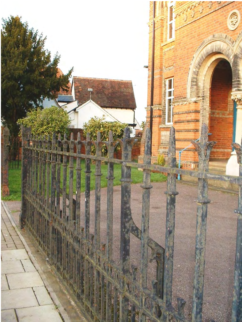
Picture 1.9 Quality unlisted railings, United Reformed Church, New Street

1.99 (The 'Sunday School building' erected in 1861 with plaque of same date inscribed 'Feed my Lambs' has been altered and extended to a degree that in the field workers opinion just warrants exclusion from this category)