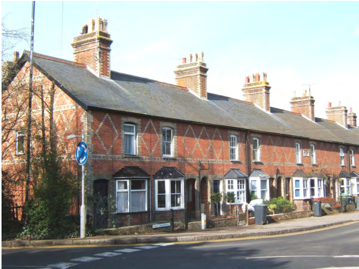
Picture 1.16 Distinctive C19 pleasant terrace built in 1884

1.144 Other distinctive features that make an important visual or historic contribution. Included in the list of individually listed buildings above there is a cast iron pump to property on south side of Parsonage Downs (now relocated to rear of property) and the wall and gate house and railings at the Clock House. Also railings to front of Nos 1 – 23, The Causeway.