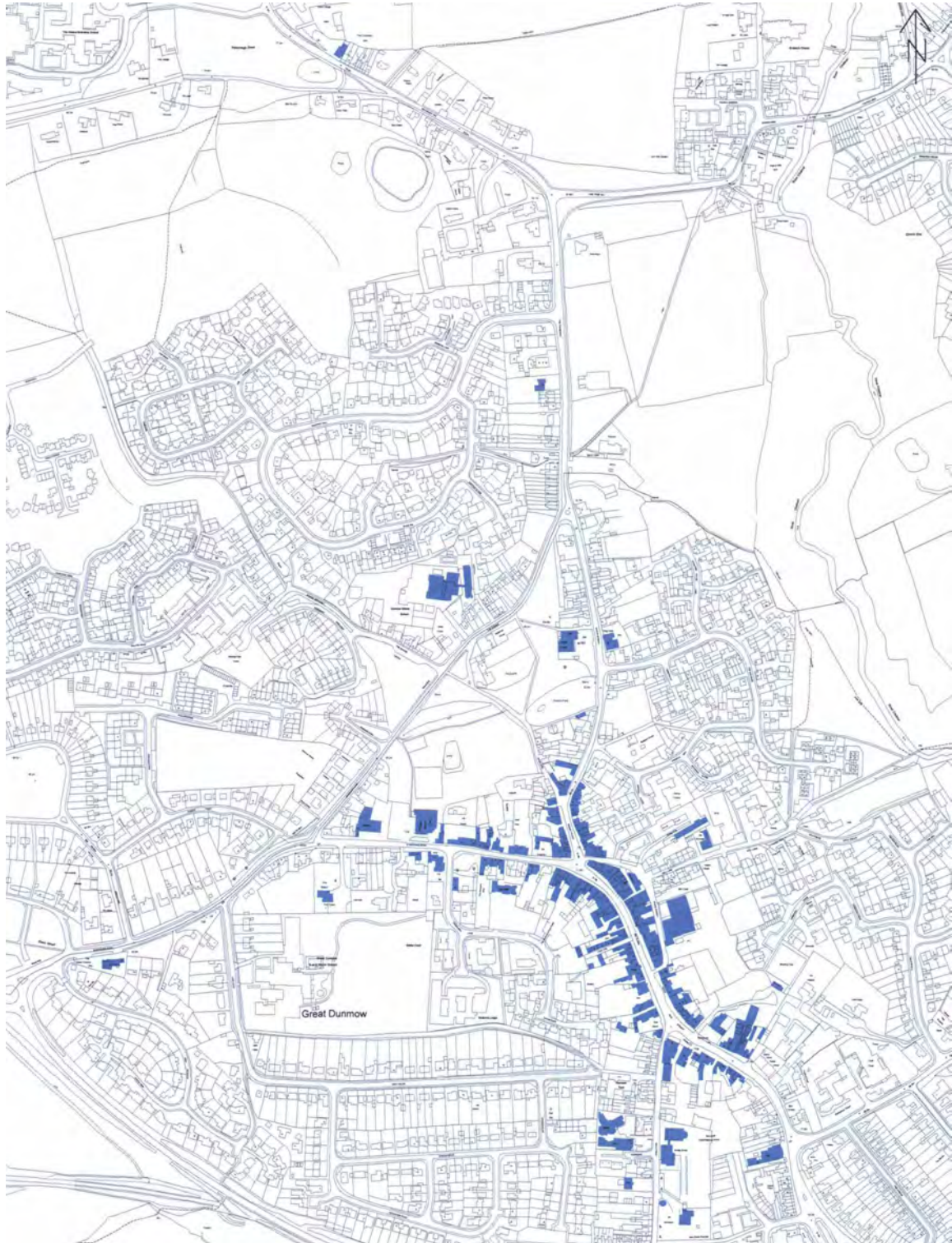
Figure 3.5 Non Residential Properties

Reproduced from the Ordnance Survey Mapping with the Permission of the Controller of Her Majesty's Stationary Office. Crown Copyright. Unauthorised reproduction infringes Crown Copyright and may lead to prosecution or civil proceedings. Uttlesford District Council Licence No: 1000018688(2006)