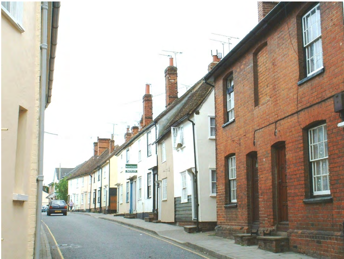
Picture 1.10 8 - 10 New Street

1.102 Nos. 8 -10. 19th century two storey brick with tiled roof and two tall decorative chimneys. Three original window range although one blocked up at later date. Original stone steps and shoe scrapers, the latter a small but unusual detail.