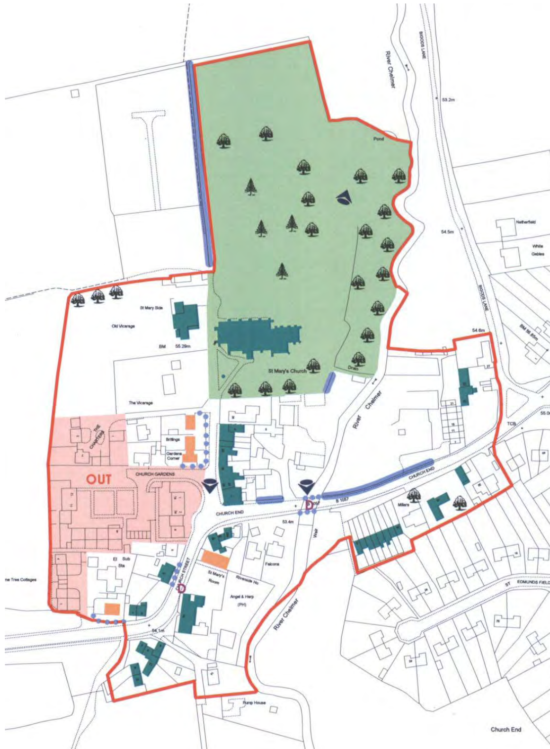
Figure 3.4 Area 3

Reproduced from the Ordnance Survey Mapping with the Permission of the Controller of Her Majesty's Stationary Office. Crown Copyright. Unauthorised reproduction infringes Crown Copyright and may lead to prosecution or civil proceedings. Uttlesford District Council Licence No: 1000018688(2006)