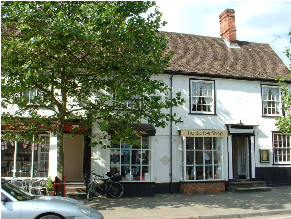
Picture 1.7 Trees enhance the High Street in several locations. Room for any more ?

1.89 Nos. 68 –72. 19th century two storey brick with tiled roof and range of four chimneys and plaque with date of 1836. Two bay windows to no.72 with quoin detailing. Two dormers with simple barge boards. Unsympathetic boundary to front detracts.