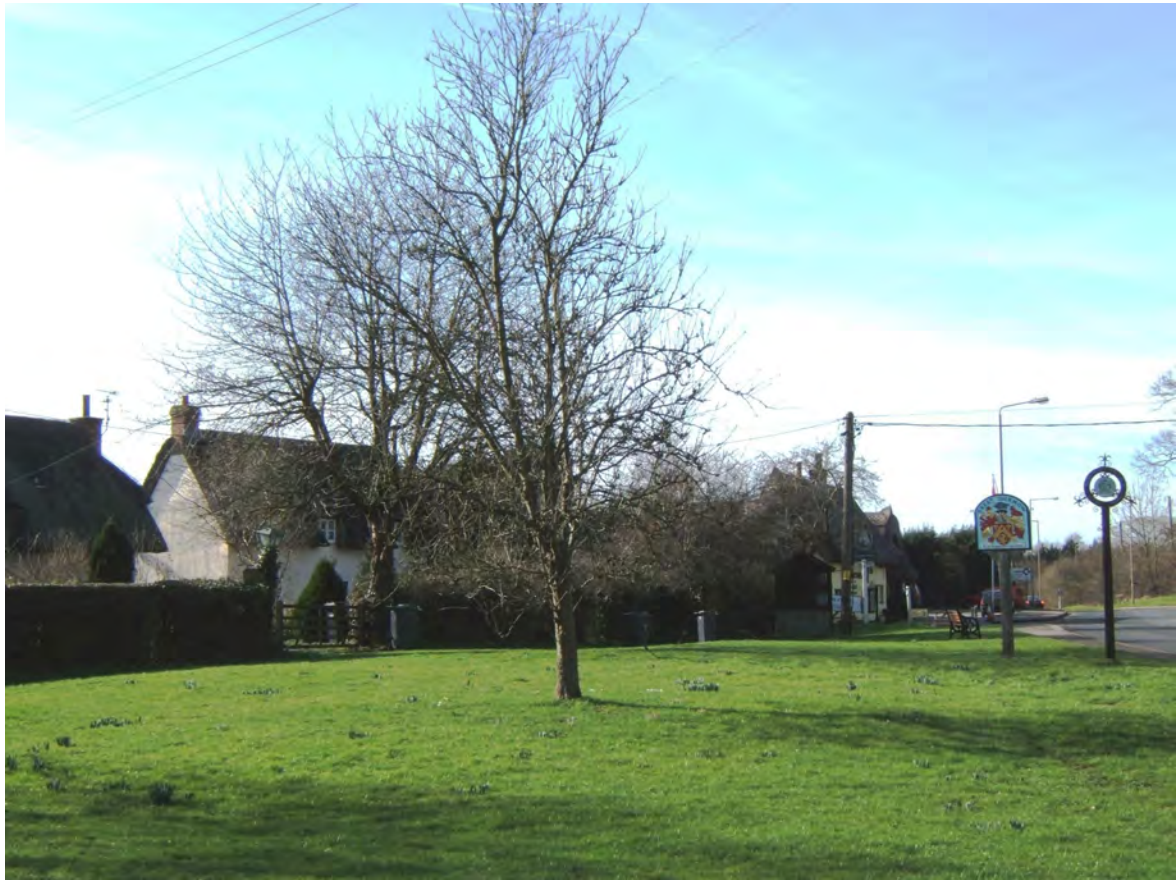
Picture 1.6 Threader's Green

1.82 Long Mynd. This two storey brick house with render detail and flat roof with chimneys is an unusual example of a contemporary mid 20th century building. It has two bay windows that extend to the first floor with render panels and a balcony over a central recessed door.