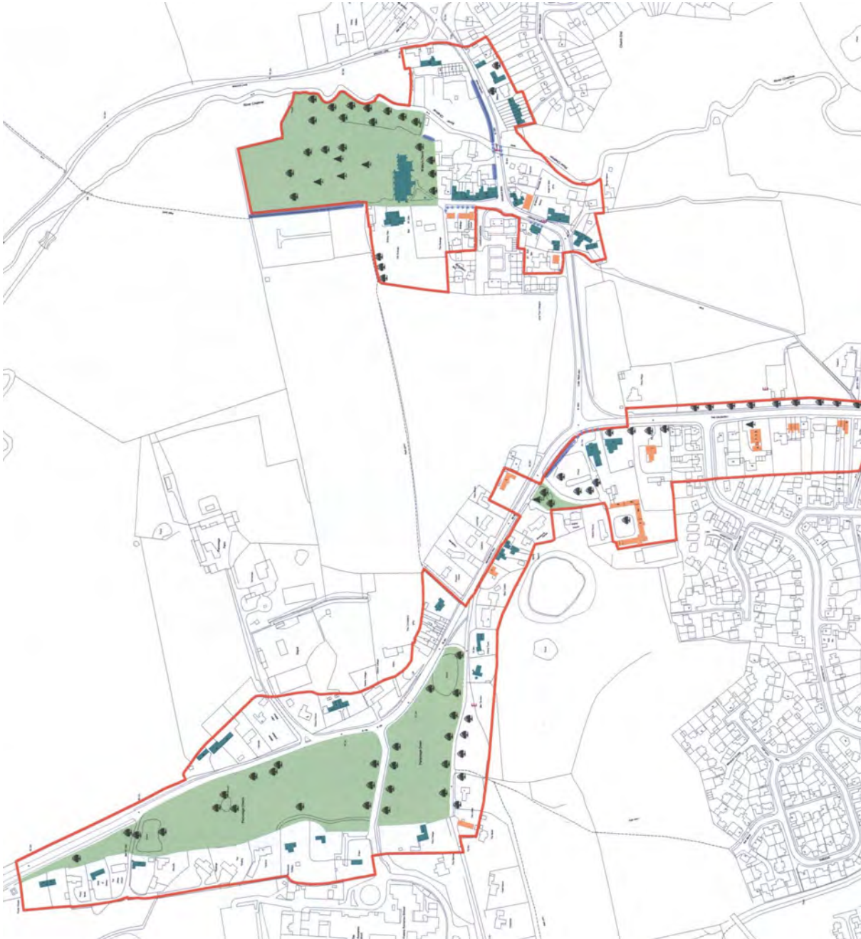
Figure 3.6 Management Plan ( North )

Reproduced from the Ordnance Survey Mapping with the Permission of the Controller of Her Majesty's Stationary Office. Crown Copyright. Unauthorised reproduction infringes Crown Copyright and may lead to prosecution or civil proceedings. Uttlesford District Council Licence No: 1000018688(2006)