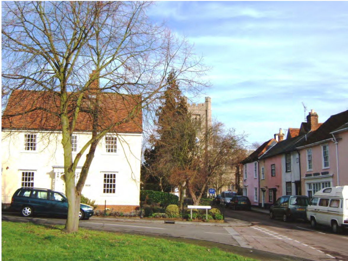
Picture 1.17 Exemplary C20 development (left) compliments quality historical tarrace (left). Church End

1.153 In relation to 20th century buildings, the new development of Britlings Gardens Corner is a demonstration that it is possible for the scale and detailing of modern development to be fully sympathetic and complimentary with a fine historic environment. This development is held up as an example to be studied (not copied) whose principles can be applied to future developments so as to improve the standards of housing design in the future.