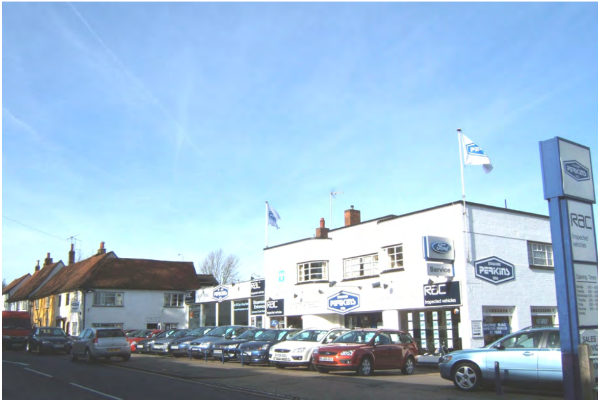
Picture 1.2 The Ford Garage site, a rare modernistic building, site proposed for comprehensive development

1.62 Individually listed buildings. There are about 130 individual buildings or groups of buildings in this area of the town. Most are Grade II but there are several that are Grade II*. These include Brook House on North Street and the Maltings at Boyes Croft, the latter having been successfully converted to a community facility and museum. There are others.