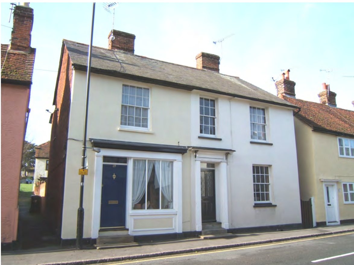
Picture 1.5 An unlisted building of quality, No 27 displaying an original shop window that must be retained

1.71 Nos. 27-29. 19th century two storey render to front with slate roof and two chimneys. A three window range, original. No, 27 has original shop window, part of the towns cultural heritage. There is a central doorway with canopy and original stone steps.