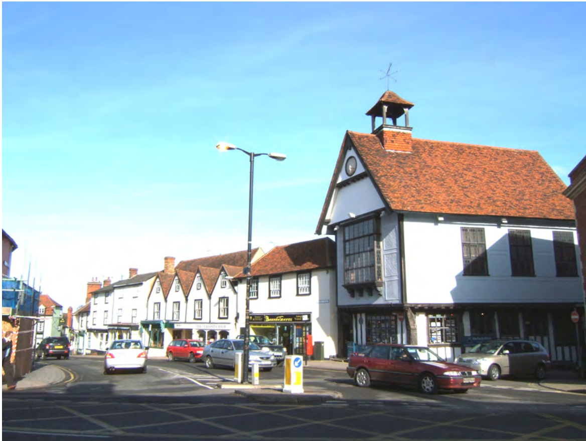
Picture 1.1 High Street - Market Place junction, an area that lacks a focal point

1.54 Market Street falls sharply away from the High Street and this sudden change of level associated with the curvature and narrowness of the street adds significantly to the character and variety of the town centre. Where Market Street joins with North Street, Doctor's Pond and the extensive area of open space known as The Downs comes into view. This feature perhaps more than any other, represents the jewel in Dunmow's crown and the retention and on going management of its open nature is very important to the environmental future of this small but expanding Essex town.