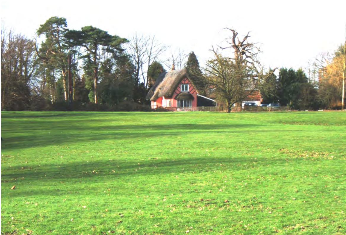
Picture 1.14 Parsonage Downs