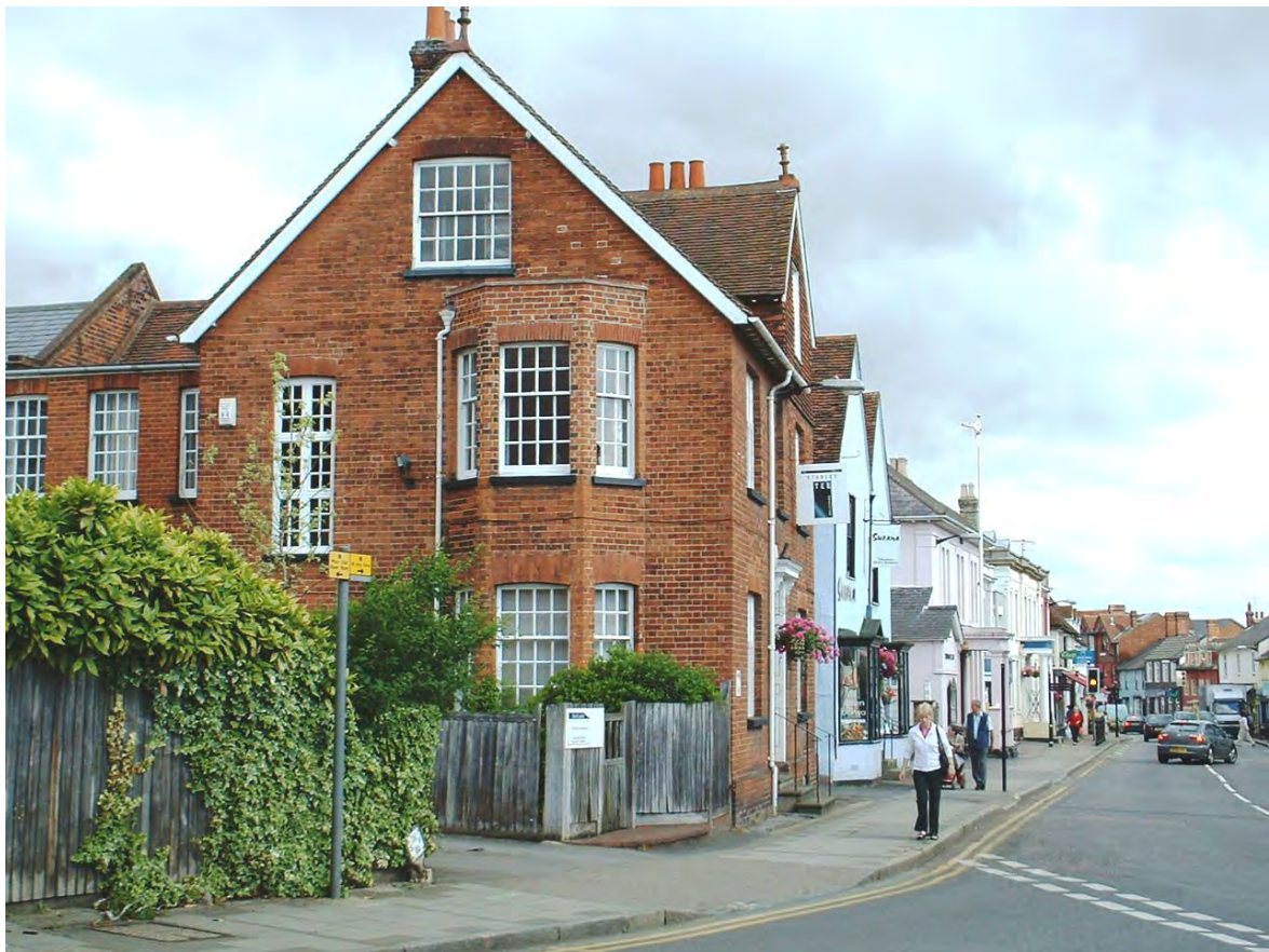
Picture 1.8 No 42 High Street, an unlisted building of quality