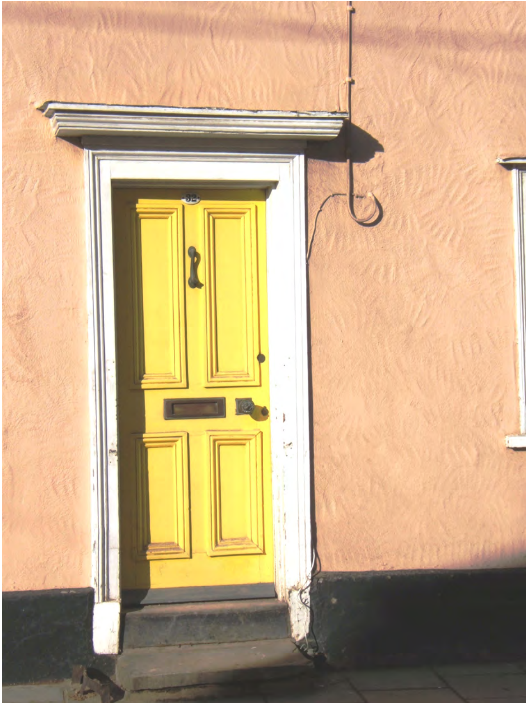
Picture 1.3 Simple and effective quality detailing

1.63 The diminutive No.13 North Street is an interesting early 19th century Grade 11 building of note and a cobblers shop until relatively recently. It was previously a single cell lock up that ceased to be used in 1843. In the 1890's it was used as a soup kitchen so a plaque affixed to the building advises.