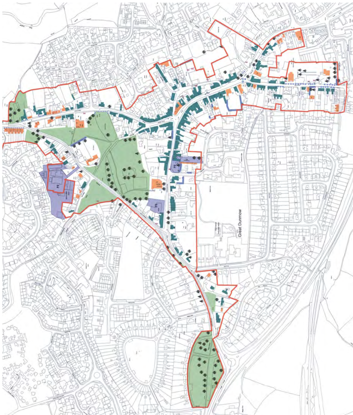
Figure 3.7 Management Plan ( South )

Reproduced from the Ordnance Survey Mapping with the Permission of the Controller of Her Majesty's Stationary Office. Crown Copyright. Unauthorised reproduction infringes Crown Copyright and may lead to prosecution or civil proceedings. Uttlesford District Council Licence No: 1000018688(2006)