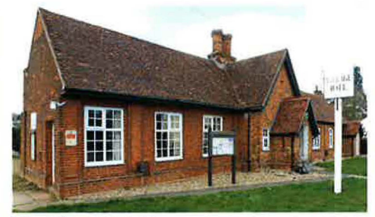
The Village Hall, 2015.