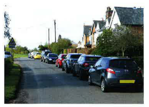
Parking along Rickling Green Road

This section also looked into the role the airport plays in the life of the village as both a transport hub and employer. Although the airport has a high profile in the area, it employs very few residents and plays a small role as a transport hub for commuters. Most journeys made from the airport are for leisure, a few people travelling several times each year, but less frequently for the majority of travellers.