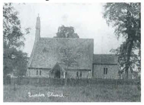
Quendon Church, 1909.

third stage dating back to the 16^{th} century. The Church of St Simon & St Jude, Quendon, is also a 13th century building. It was altered in the 16^{th} century and further restoration and building work was carried out in 1861. The tower was hit by a lightning strike in 1941 and was later pulled down. It was replaced by the current tower and three bells in 1963. Details of other listed buildings in the village can be found on the British Listed Buildings website<sup>1</sup>.