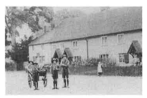
Boy Scouts and Scout Master in Rickling, 1915.

In the early 20<sup>th</sup> century, a variety of clubs could be found in the village. A Mothers' Union, Women's Institute, Men's Society and Scouts held regular meetings, with a Horticulture Society and Flower Club catering for gardening enthusiasts. In the early 1900s a Coal Club and Shoe Club were set up, a weekly membership acting as a savings scheme for people. Sports clubs were also popular. In 1883, the village had an Archery and Tennis club, and the Tennis Club was