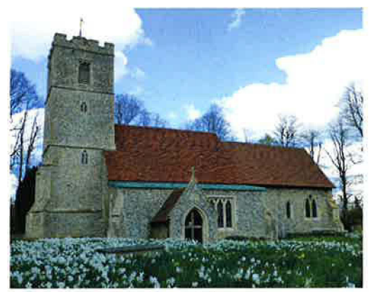
All Saints Church, Rickling, 2015

64% of respondents felt that nursery provision was inadequate in the village, although some nursery places are available in surrounding towns and villages. We do have a successful Bumps, Babies, Toddlers and Parents Group in Armadillos and they meet in the Village Hall