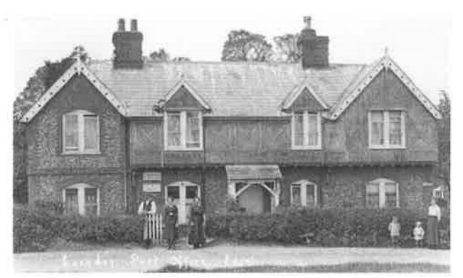
Old Post Office, c.1906.

Quendon windmill would have been a prominent local landmark. First mentioned in 1678, the original Post Windmill was blown down in 1795 and replaced by a Tower Windmill in 1805. This in turn was demolished c1900.