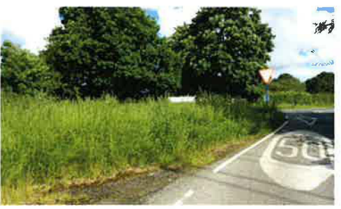
Junction of Belcham's Lane with the B1383.