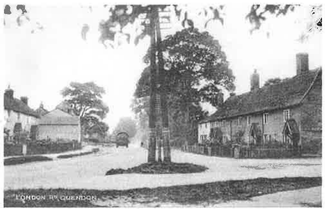
Junction of what is now, Rickling Green Road and Cambridge Road.

The 1870s saw the beginning of the decline in agriculture. The village population had increased to 708, with new trades and professions appearing on the census, but farming was still the main employment, with 129 men listed as agricultural labourers. By 1901, a population of 527 reflected the general move away from the land to the towns and cities. The agricultural workforce now totalled just 37, with 5 stock-keepers and a cowman listed. By the beginning of the 20th century, the village had witnessed some radical changes in society. Records show the population as 534 in 1931, rising slightly to 557 in 1951. Although still a rural community, the majority of the workforce no longer worked on the land.