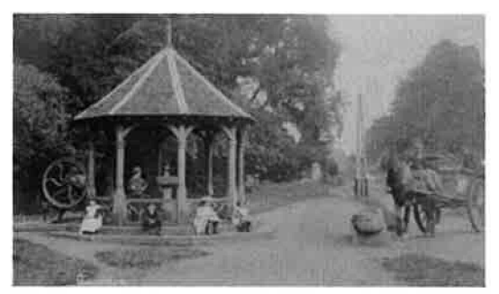
The Pump at the beginning of the 20th century.

Another familiar building is the Village Hall, which began life as a Reading and Coffee Room. A 'Grand Bazaar' was held in the grounds of Quendon Hall to raise funds for its construction.<sup>10</sup> Later that year a 'Fancy Bazaar' was held to raise funds for the building of the Parish Room. The curate of Rickling believed this 'would be a boon to inhabitants' and could also be used for religious and other purposes.<sup>11</sup>