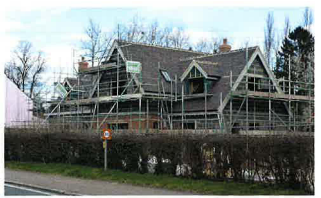
Two developments along the Cambridge Road, 2015

also considered infill plots as suitable sites for development.