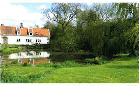
Dell Pond, Rickling Green, 2015.

An interest was also shown in future environmental projects; ideas such as the restoration and development of local ponds, a woodland trail and bulb planting were well supported. Better allotment facilities also attracted some interest and in Question 10, people were asked if they would be willing to help with these initiatives. The results show that there is both an interest in, and a will to engage with the local environment and this