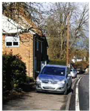
Pavement obstructed along Cambridge Road, Quendon.