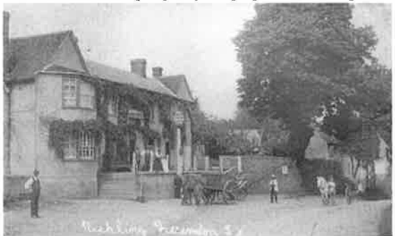
Coach and Horses, c. 1905