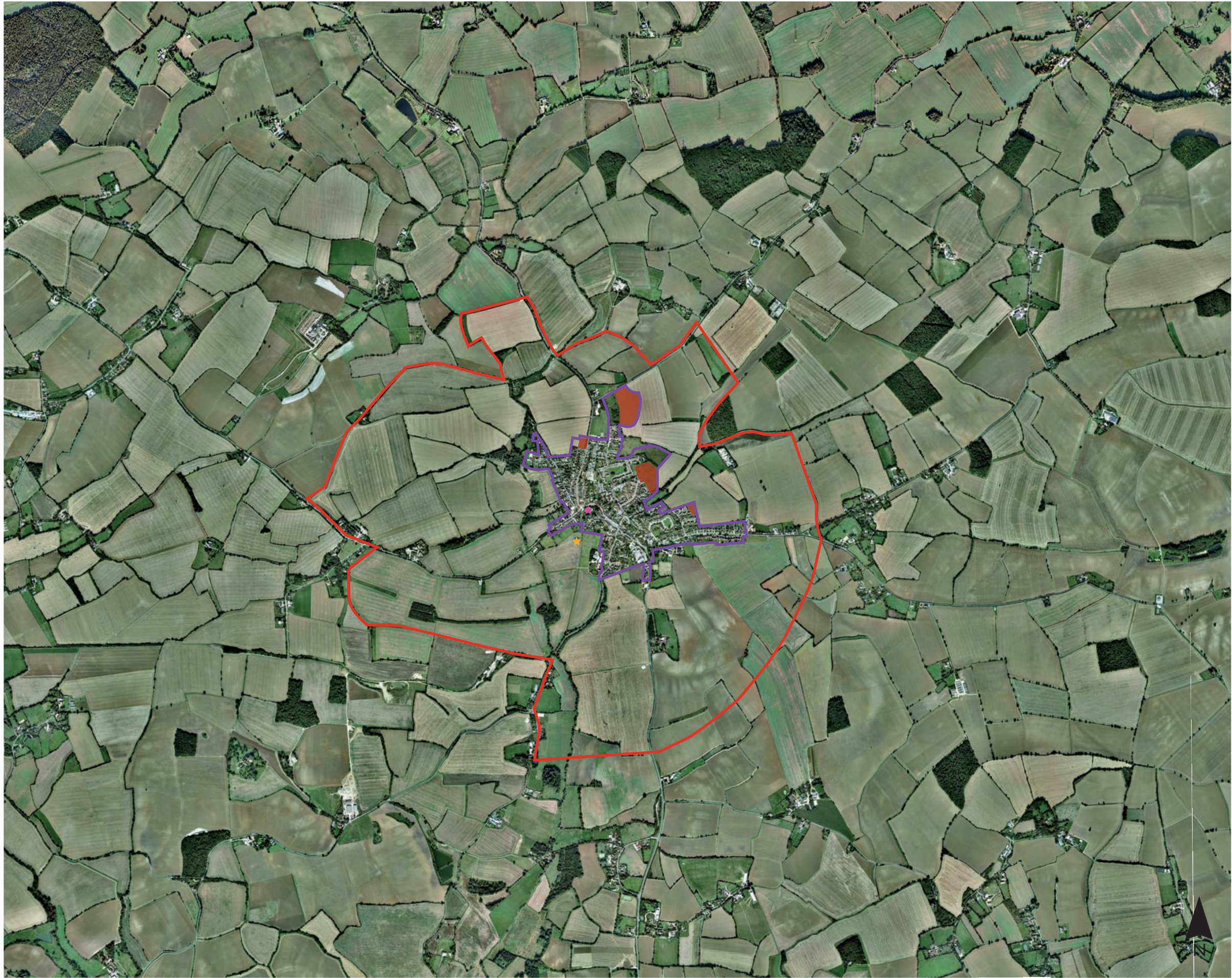
Figure 2 Site context (aerial photograph)