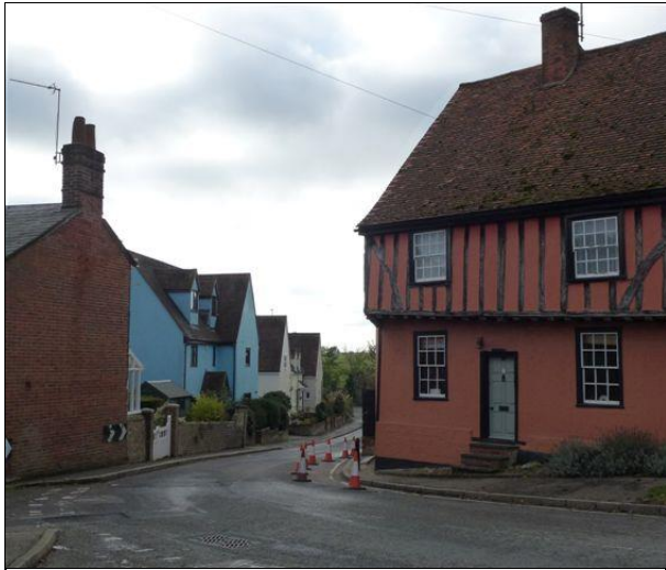
Above: Number 36