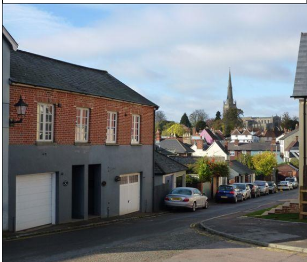
Above: The organ works and view