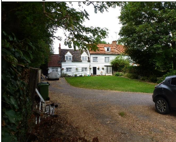
Above: Brooklyn's Cottages