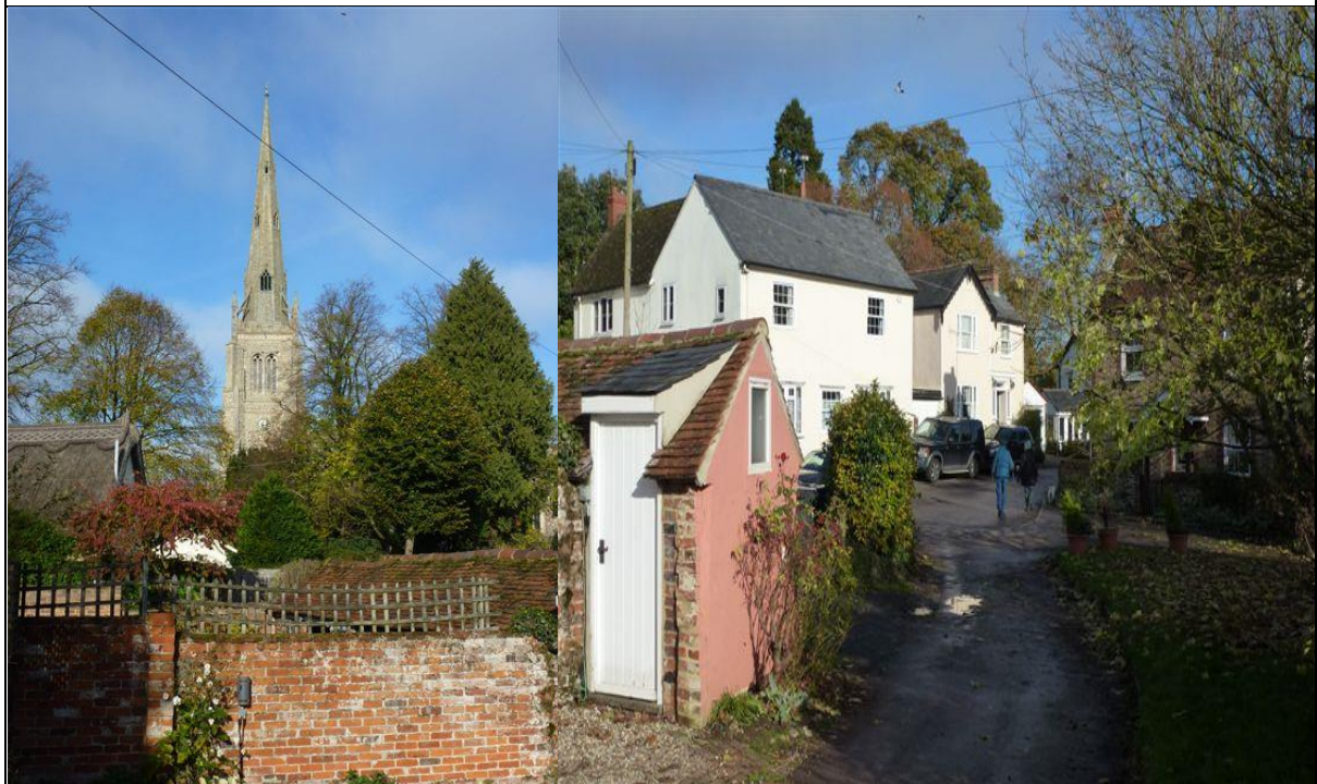
Above: View through to the church