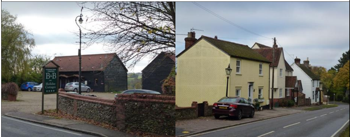
Above: Totmans Farm B&B