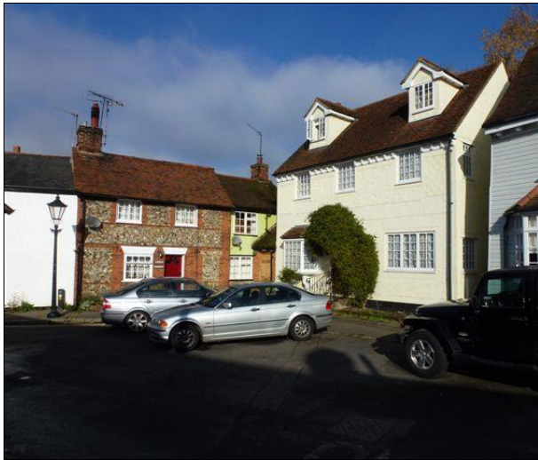
Above: North East corner