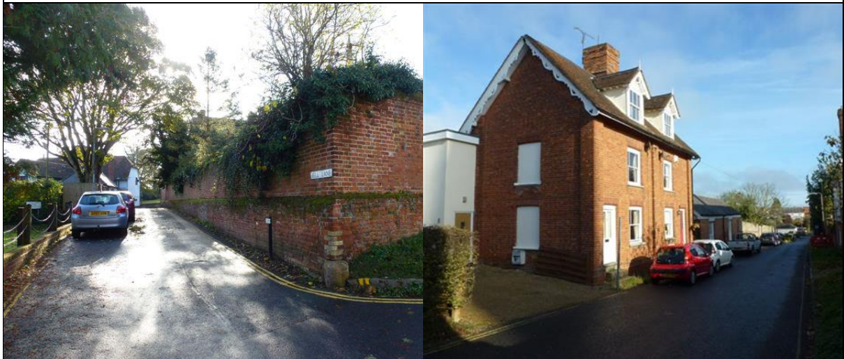
Above: Junction with Bell Lane