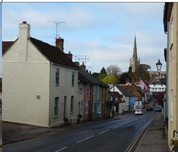
Above: A better view