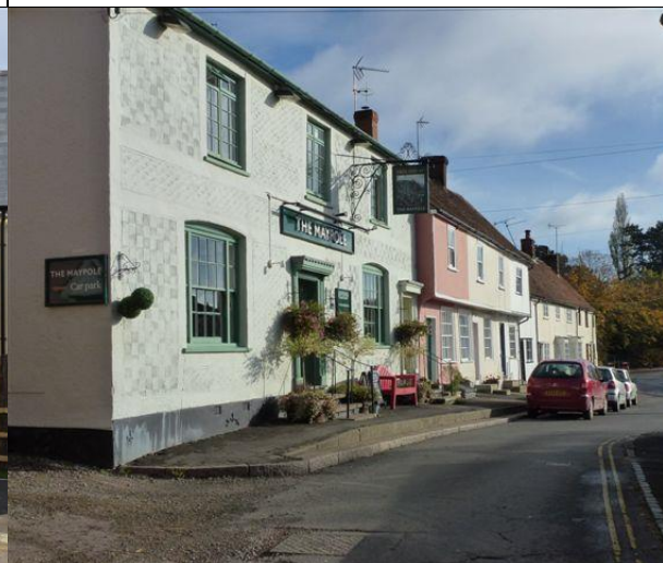
Above: The Maypole