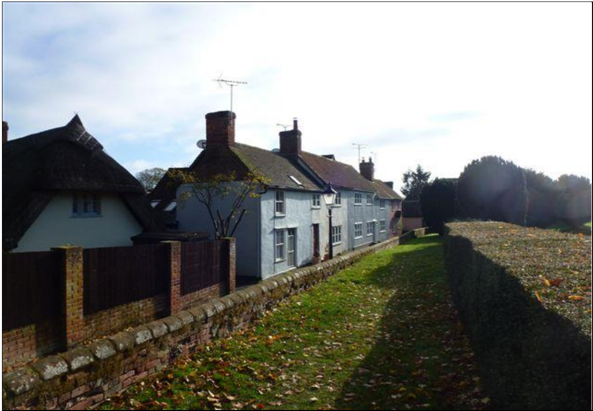
Above: East side