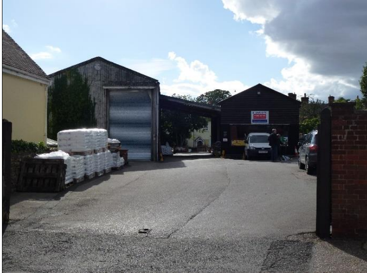
Left: Lowe's Yard