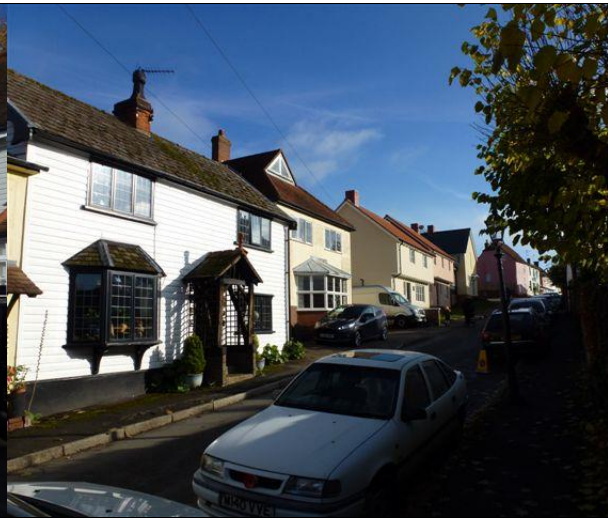
Above: Looking South