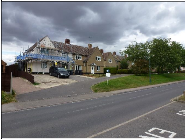
Above: Wainsfield Villas