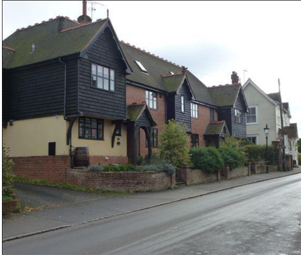
Above: Interesting modern development