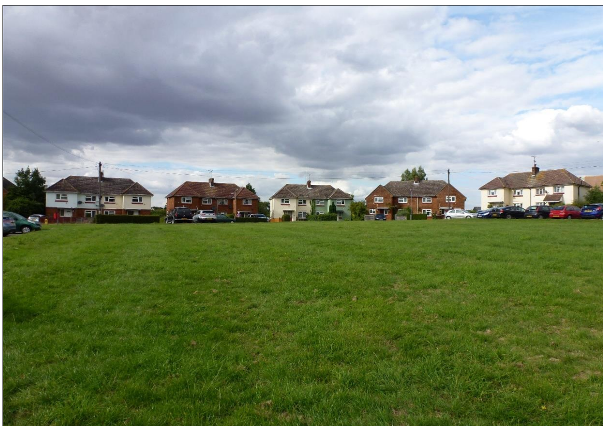
Above and Below: Magdalene Green