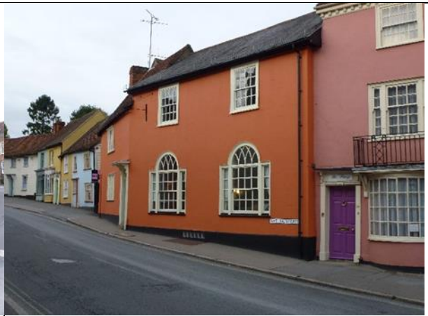
Above: The former Cock