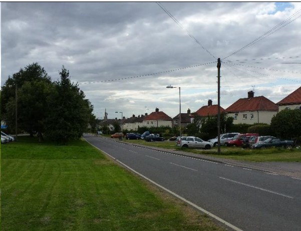
Above: North side