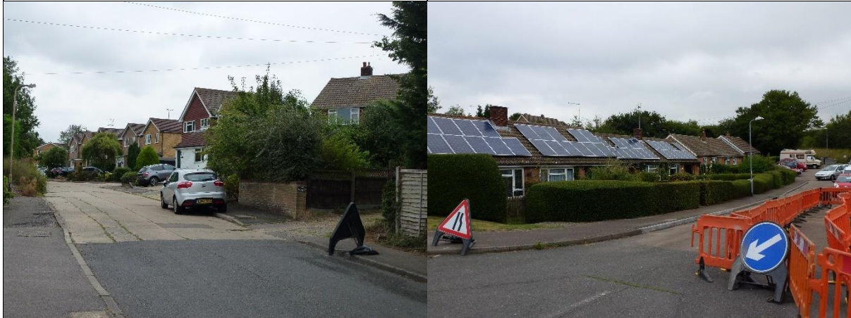
Above: Guelph's Lane