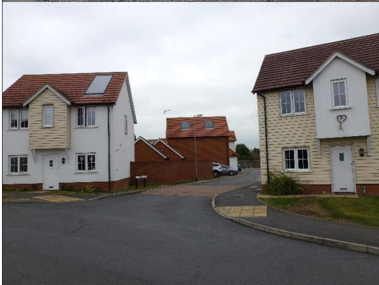
Left: Cooper's Place