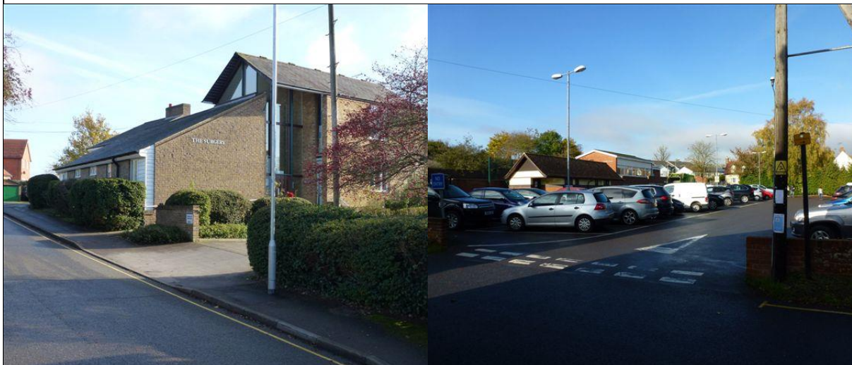
Above: The surgery