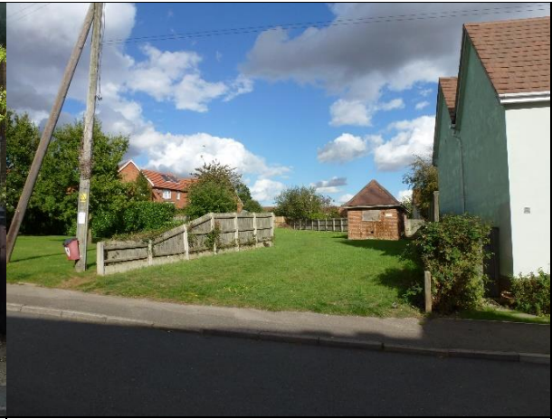
Above: The old telephone exchange