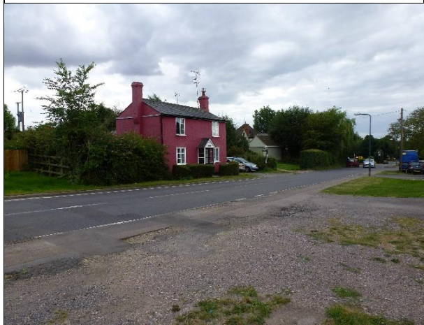
Above: Woodbine cottage