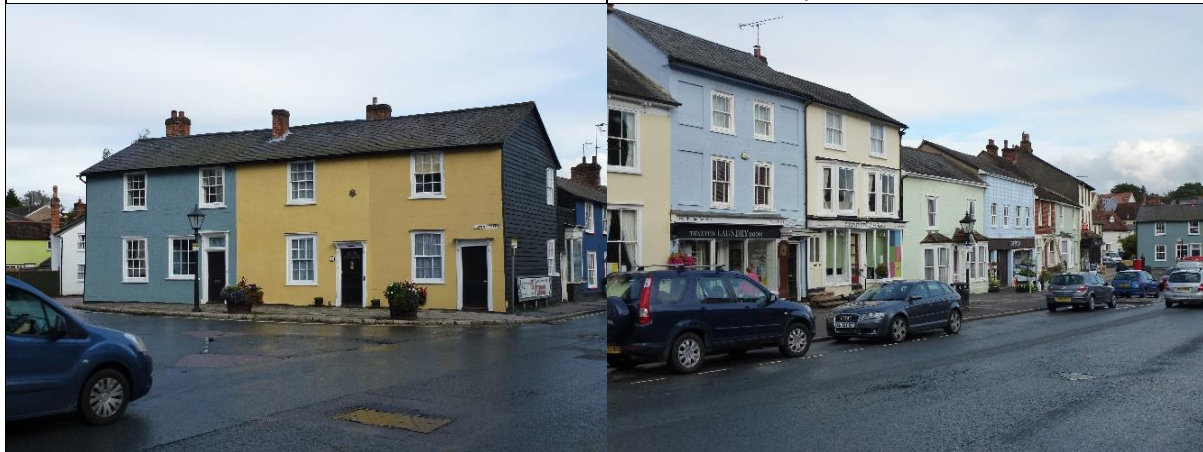
Above: Nos 2-6