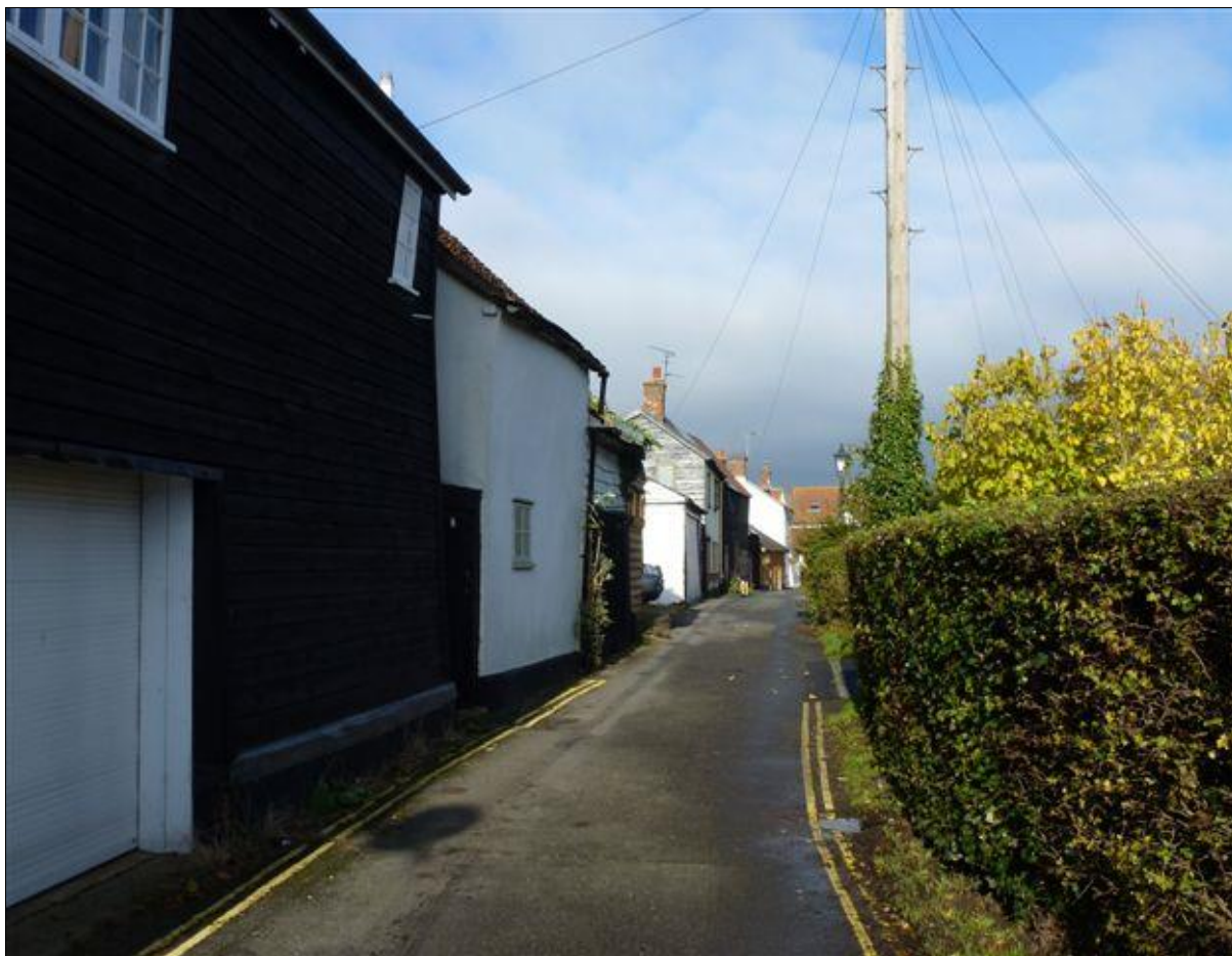
Above: Looking north