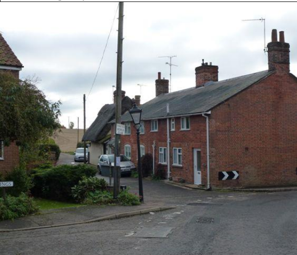
Above: Park Street corner