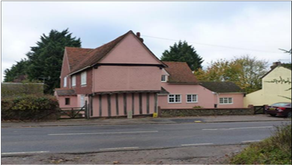
Above: Totmans Farm