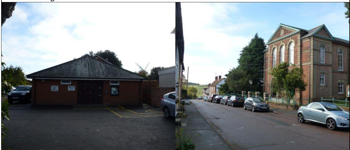
Above: Bolford Street Hall