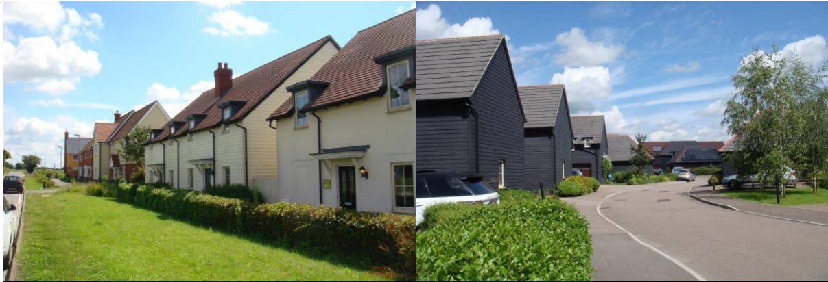
All photographs: Typical Bellrope Meadow housing