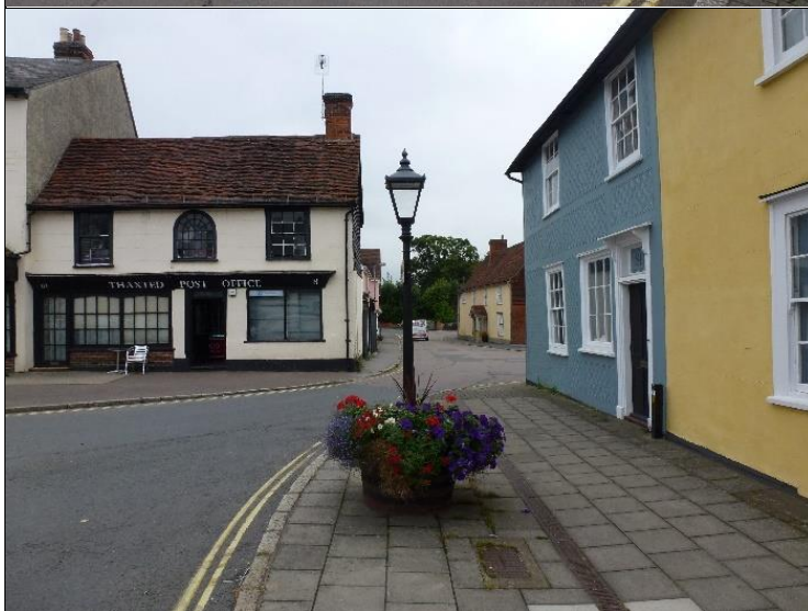
Left: Junction with Town Street