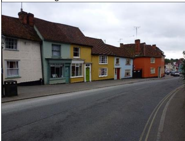
Above: Looking towards Town Street