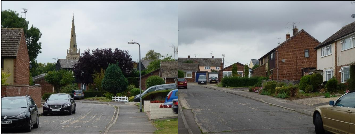
Above: A view of the church