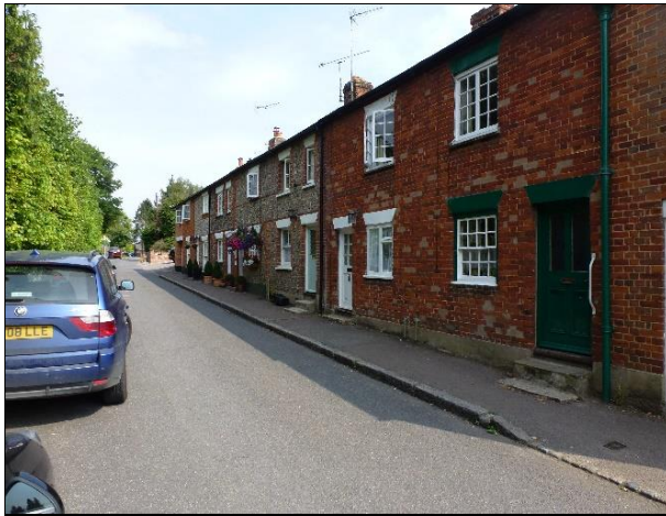
Above: Bridgefoot Cottages