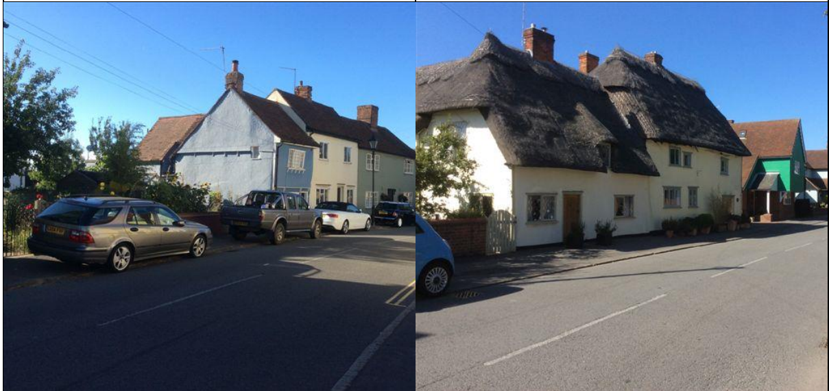
Above: West side looking north