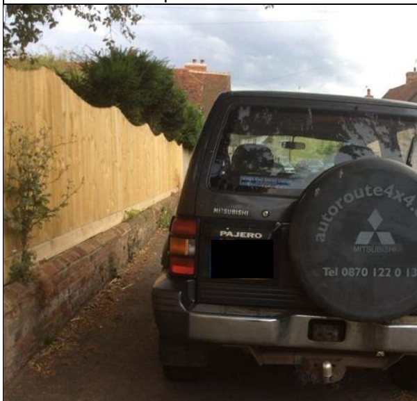
Above: Thin pedestrians only?