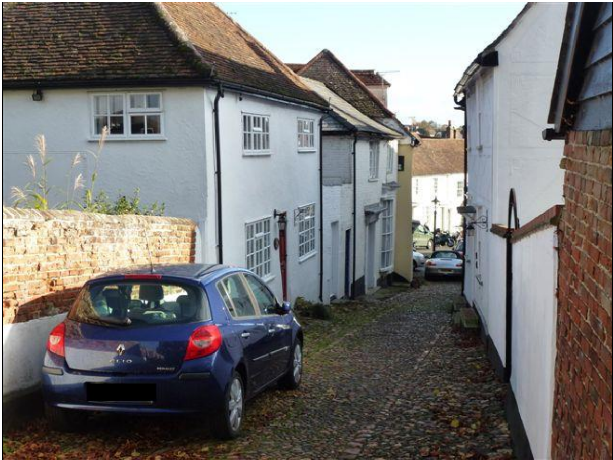
Above: Blighted by cars