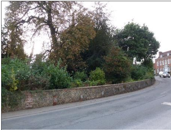
Above: Memorial garden