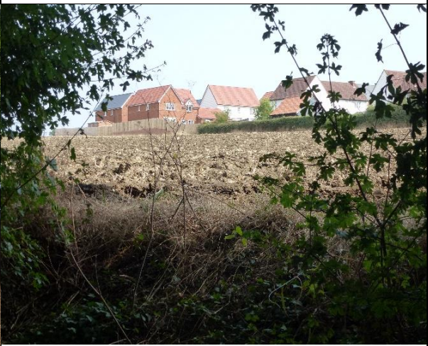
Above: View of Barnard's Field