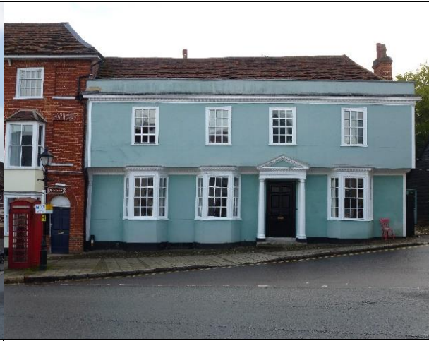
Above: No. 25