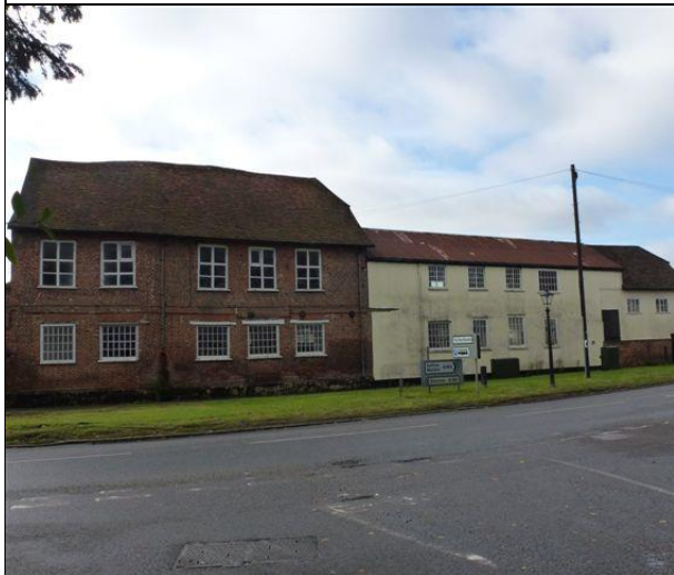
Above: Molecular site