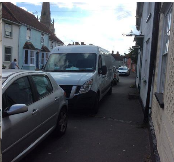
Above: A cluttered pavement