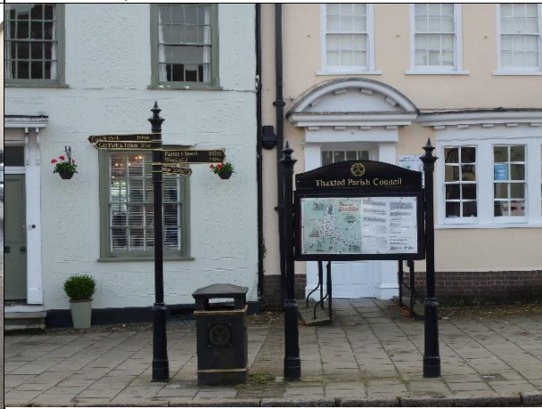
Above: Street furniture