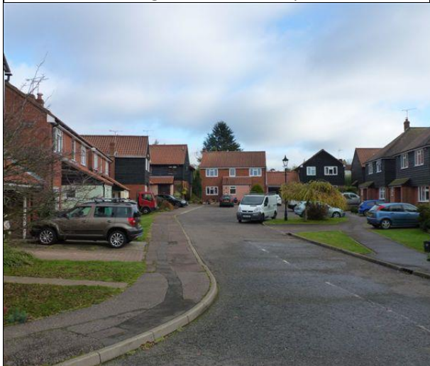
Above: The Maltings