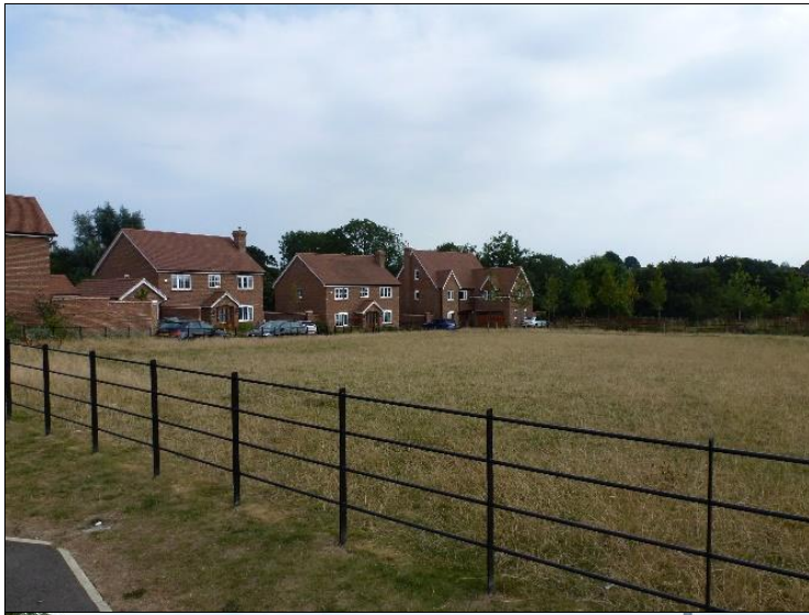
Left: 2015 development