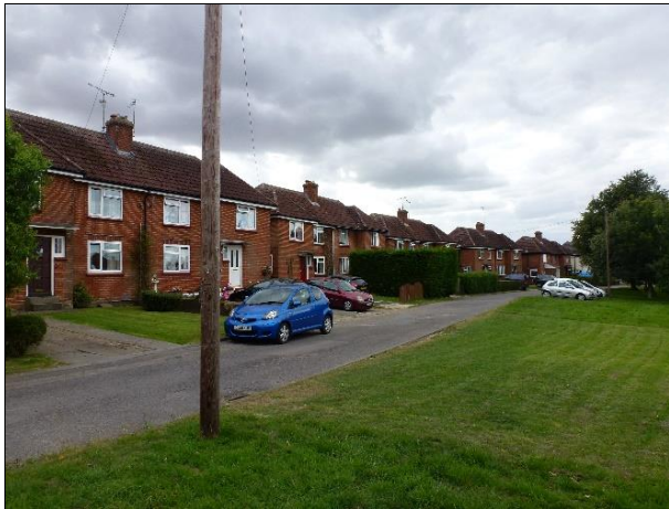
Above: South side