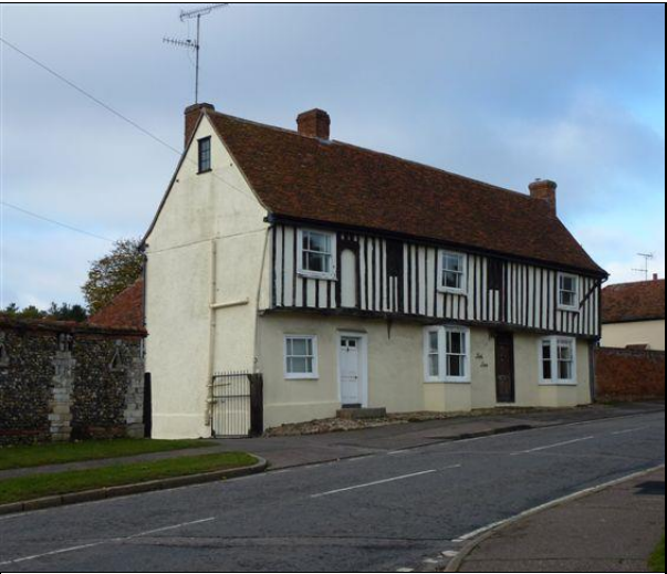
Above: Park Farmhouse