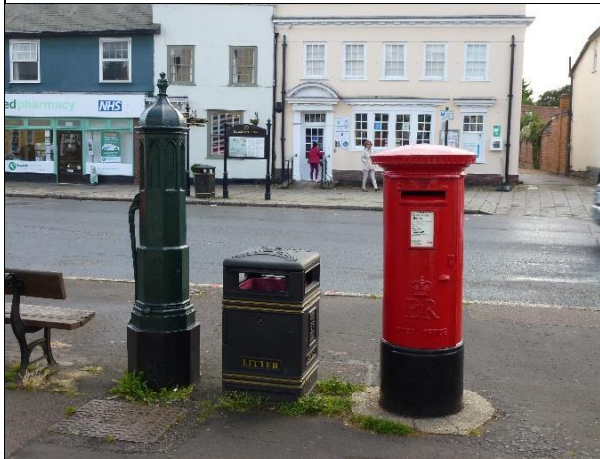
Above: Poorly placed litter bin