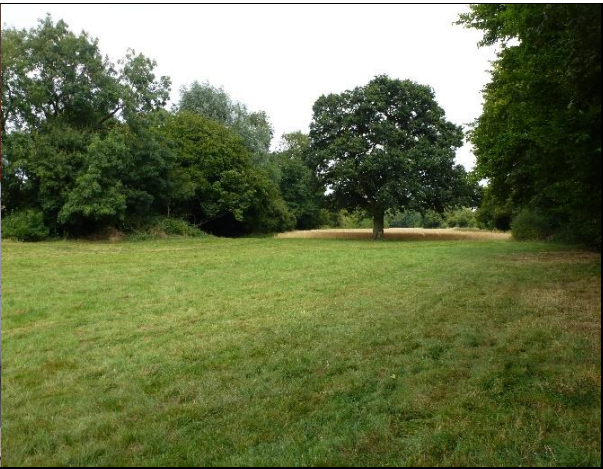
Above: Walnut Tree Meadow