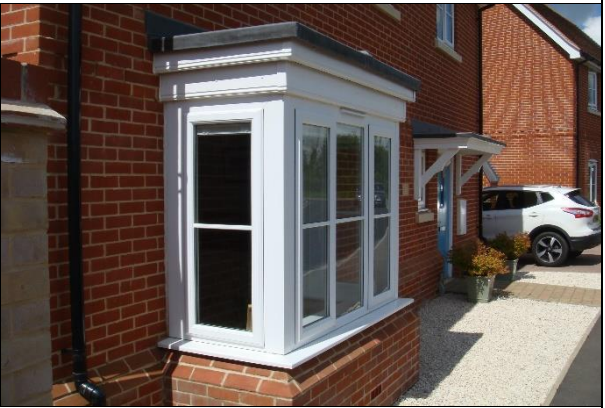
Above and Below: Good detail