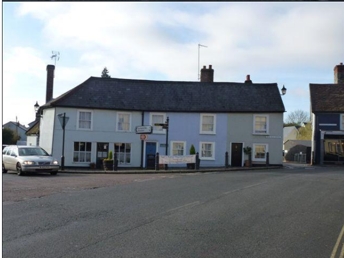
Left: The Bullring