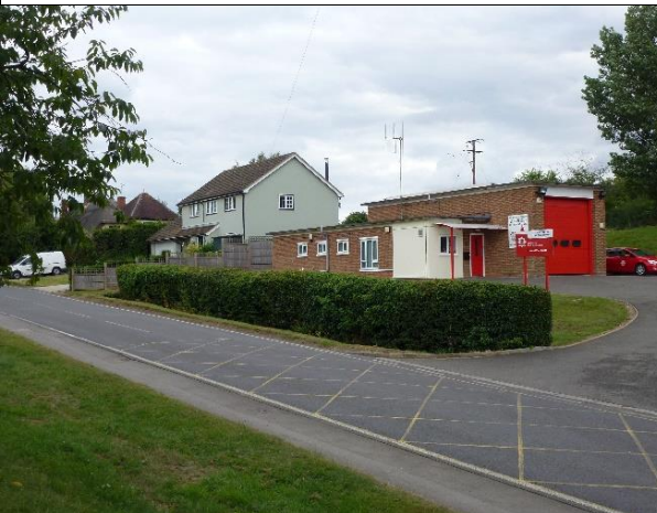
Above: The Fire Station