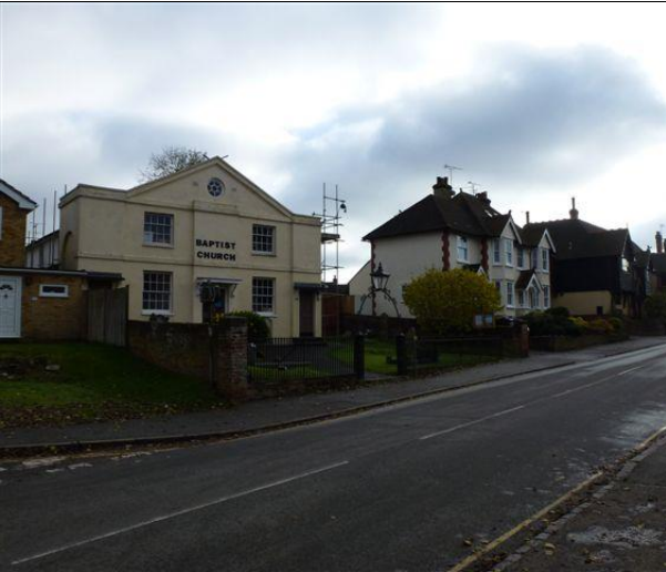
Above: East side