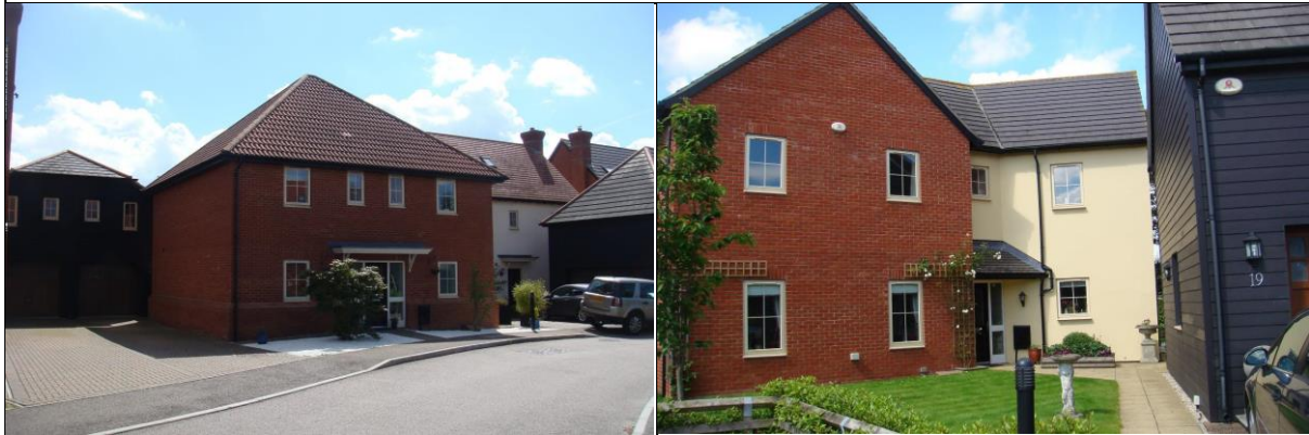
Above: Note the bollard in the foreground