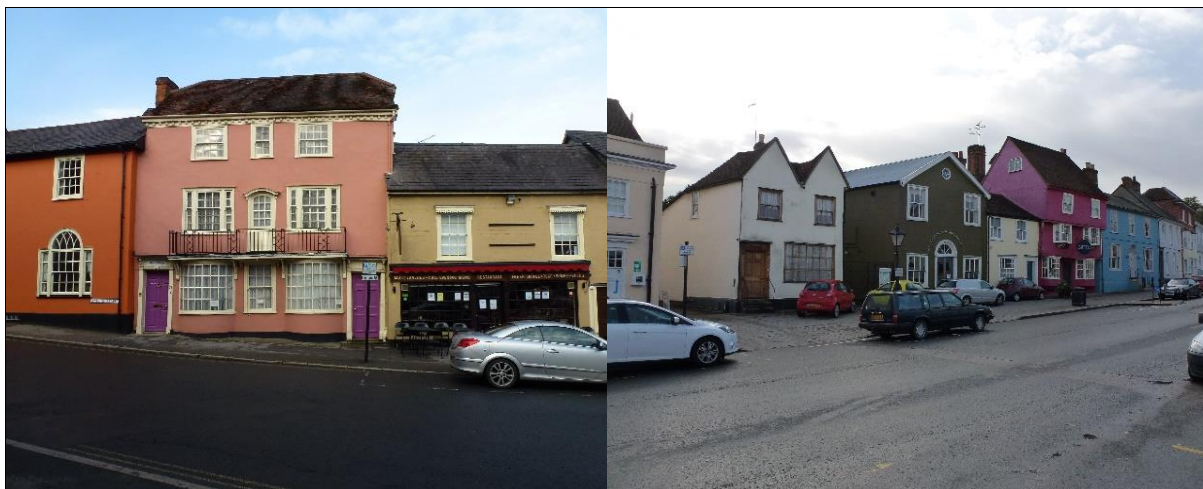
Above: The Priory