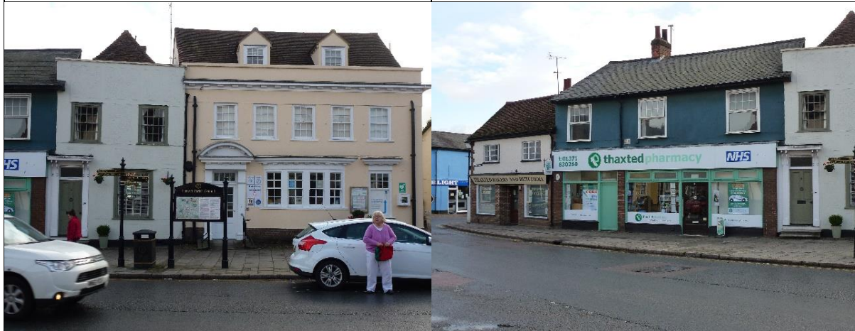
Above: The CIC