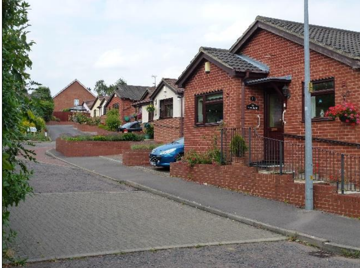
Left: Hanchetts Orchard