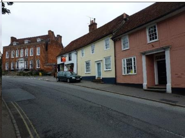
Above: Looking towards Clarence House