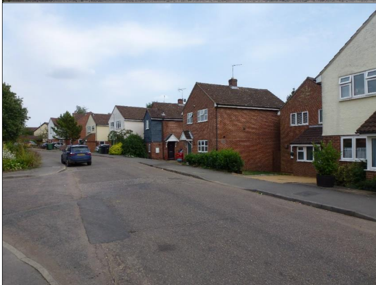
Left: Older housing