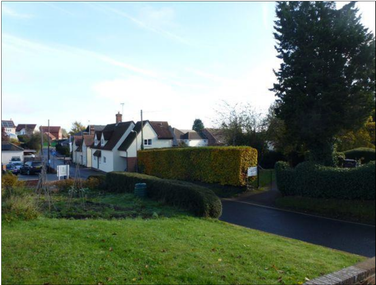
Above: South side