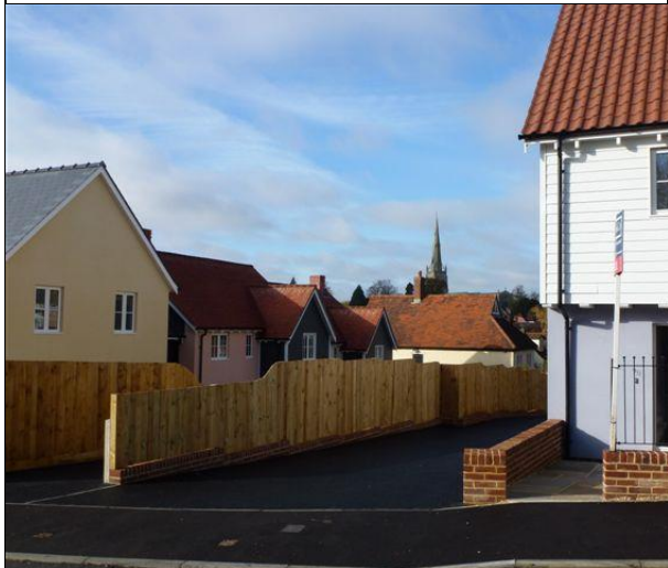
Above: New development – preserved view corridor