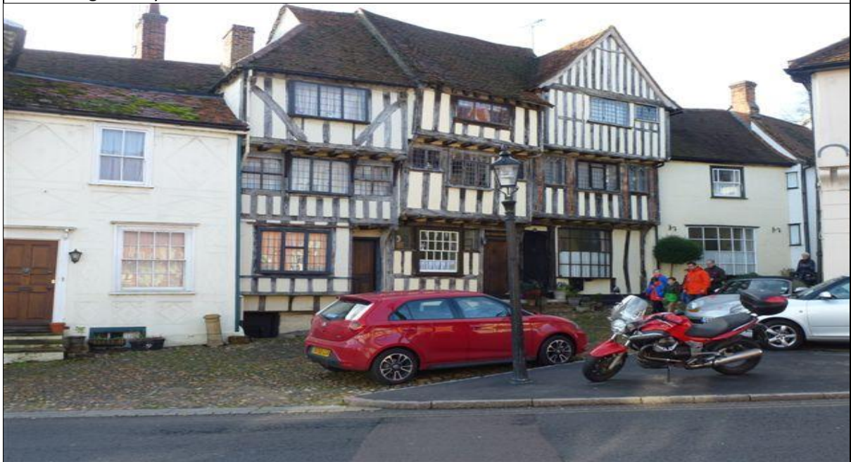
Above: Former merchants' houses