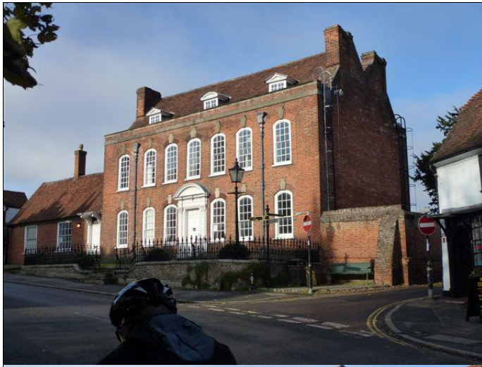
Left: Clarence House