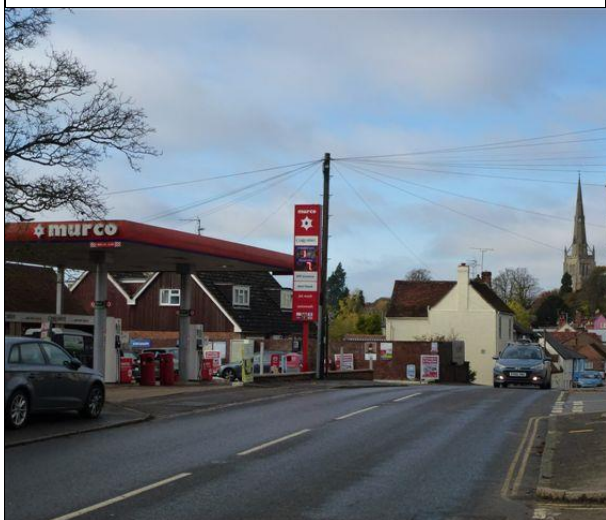
Above: A spoilt view