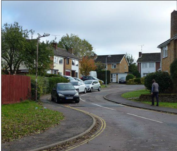
Above: Star Mead