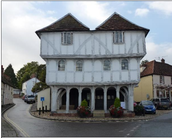
Above: The Guildhall