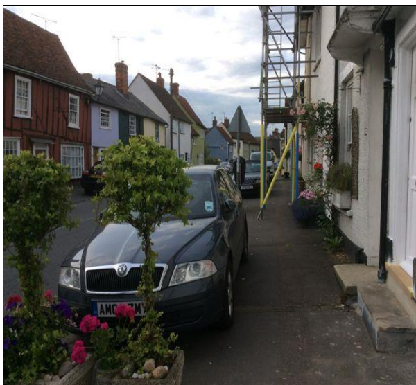
Above: A cluttered pavement