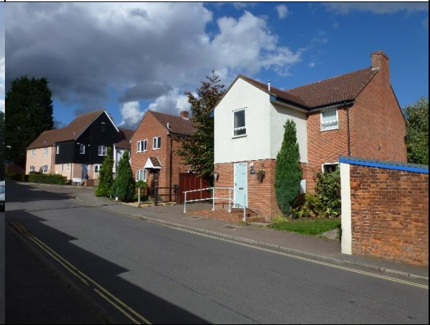
Above: Looking north