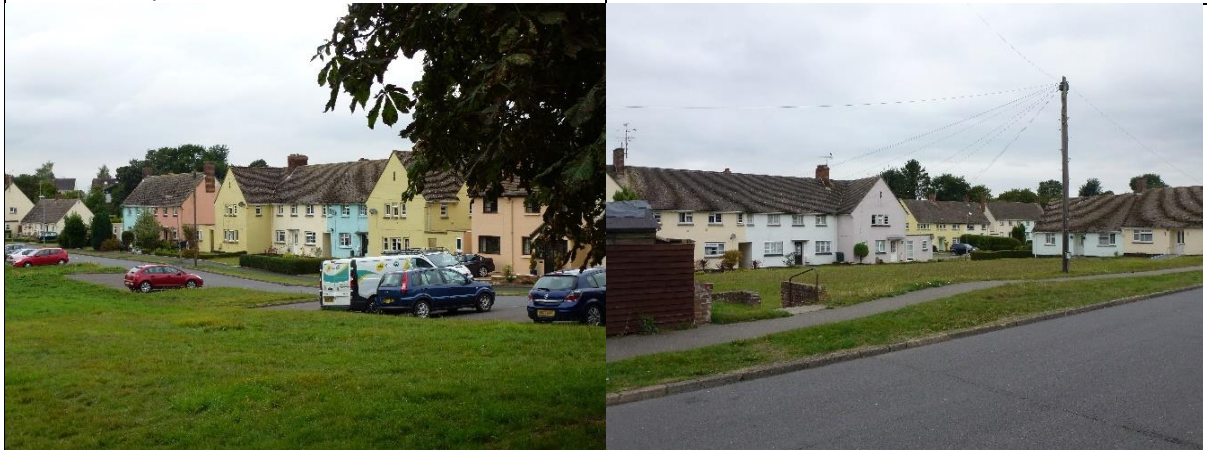
Above: Weaverhead Close