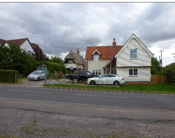
Above: Coldham's Fee