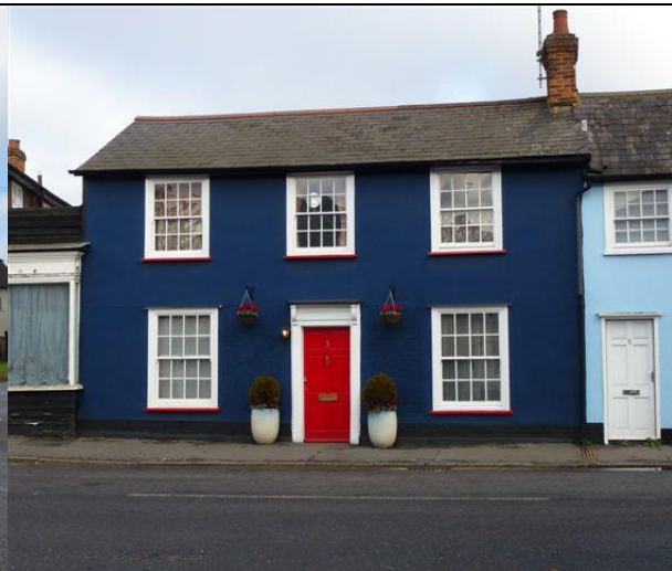
Above: The Union Jack house