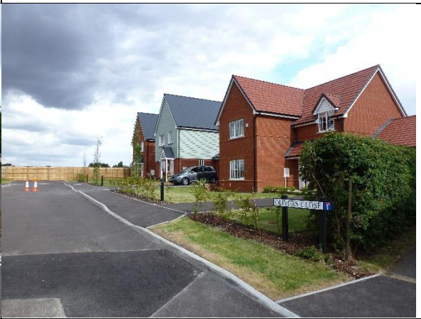
Above: Oliver's Close