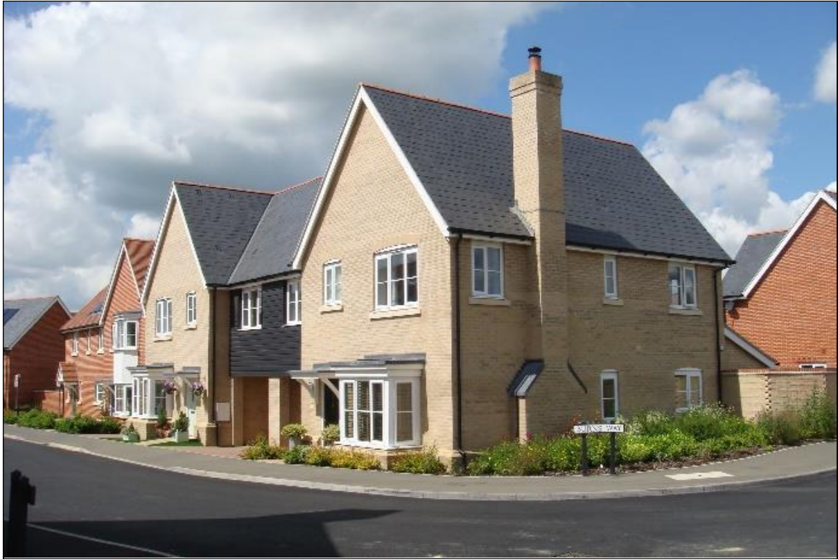
All photographs: Typical Thatcher's Grange housing