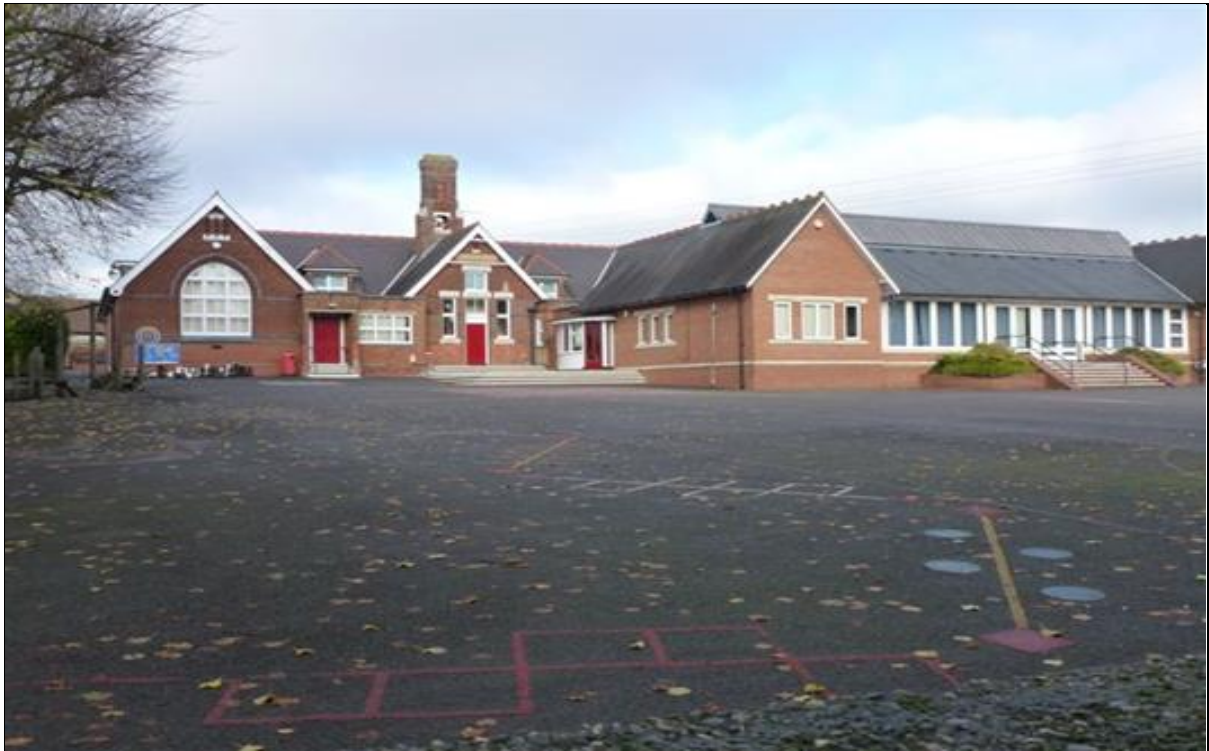
Above: The school