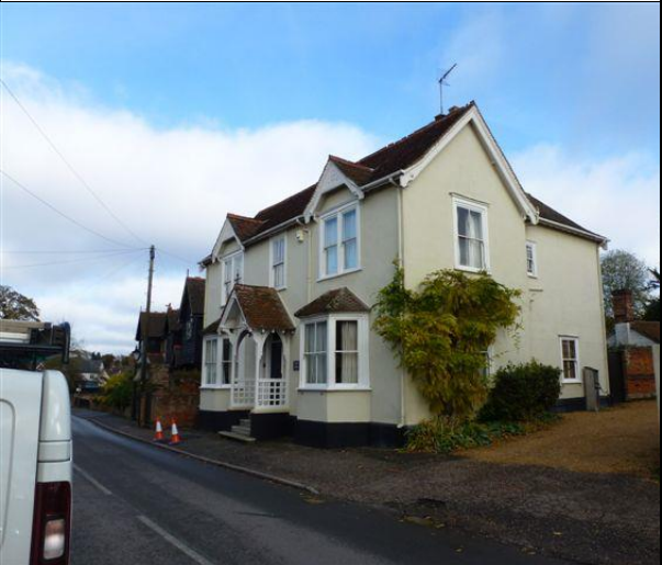
Above: Park House