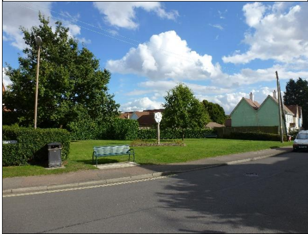
Above: The Green looking south