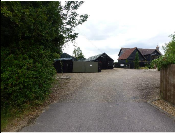
Above: Levett's Farm