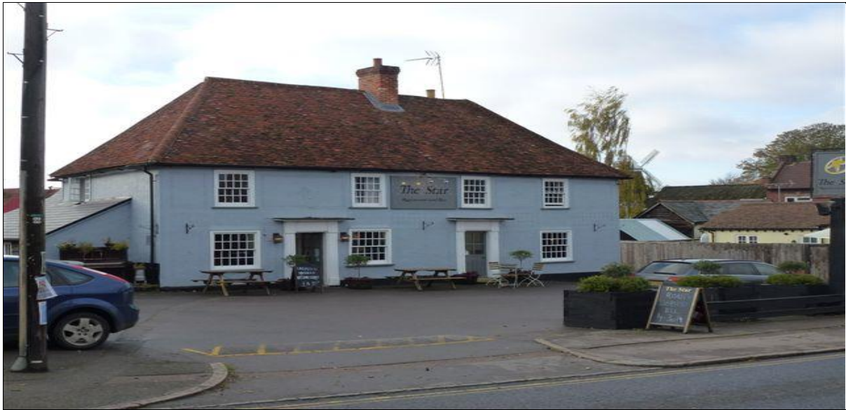
Above: The Star