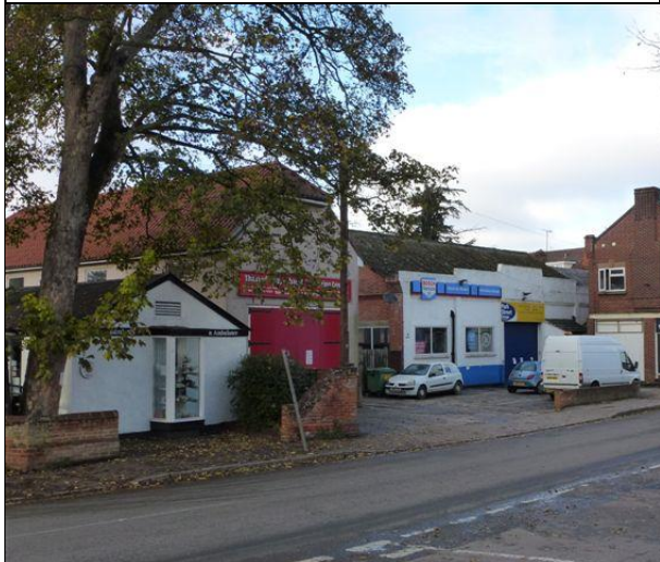
Above: The Garages