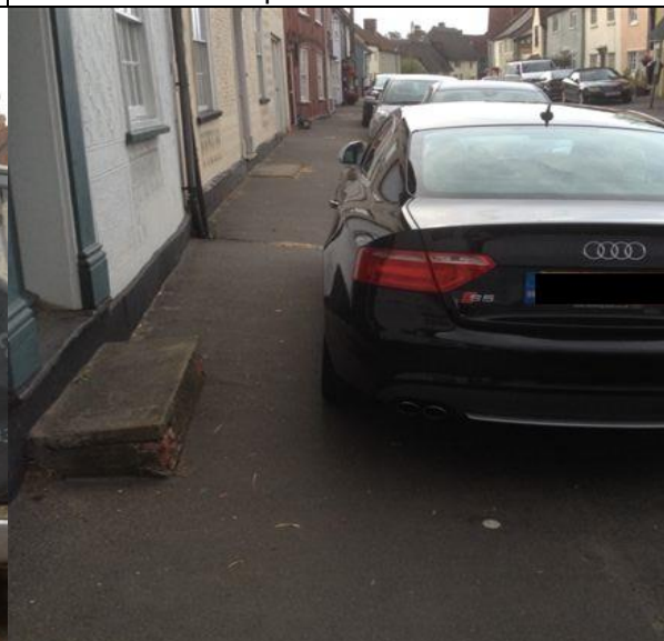
Above: Not very wheelchair friendly!