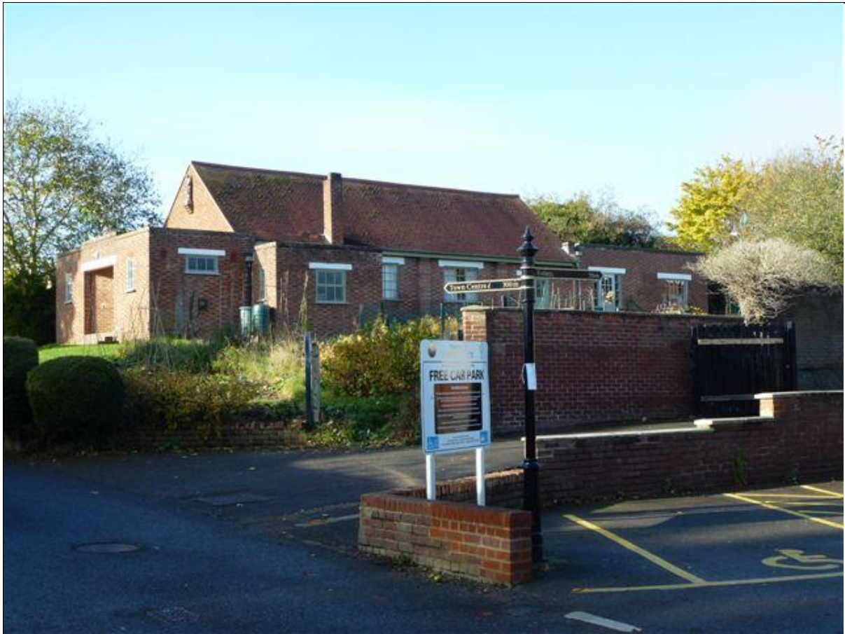
Above: The church hall