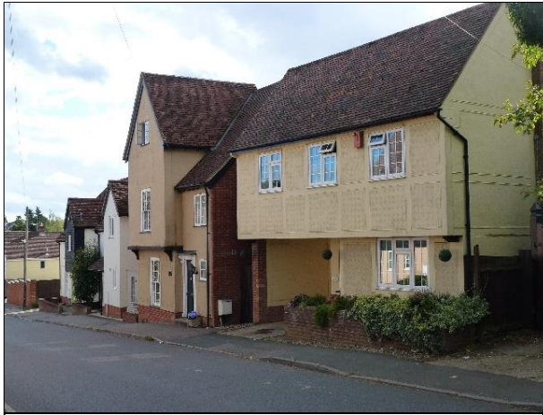
Above: Orchard Close