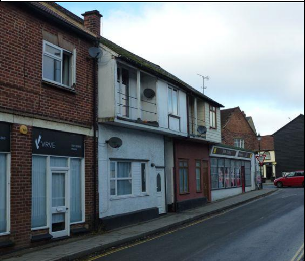
Above: Town Street Corner