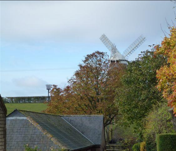
Above: A glimpsed view of the windmill