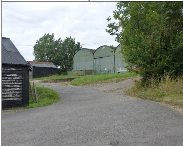
Above: Claypitts buildings