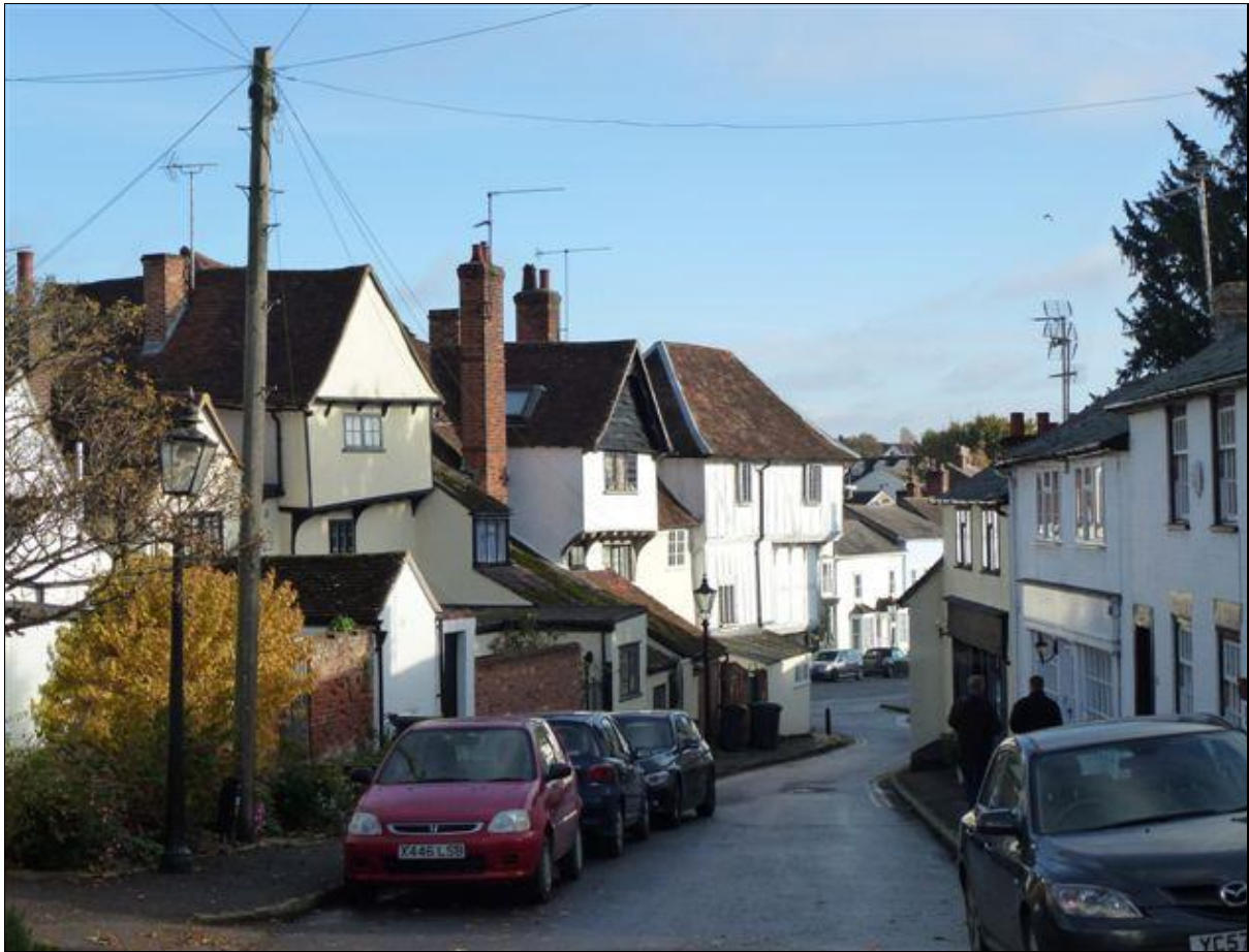
Above: Towards the Guildhall