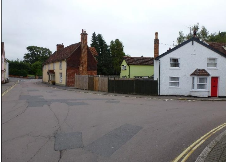
Left: Orange Street Corner