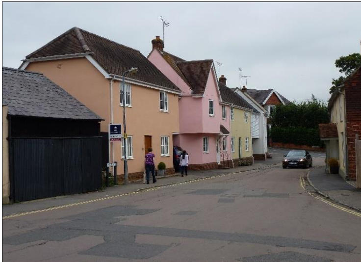
Left: Orange Street corner