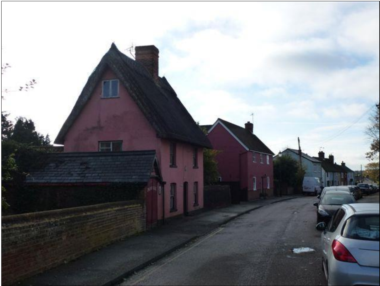
Above: Looking towards Debden