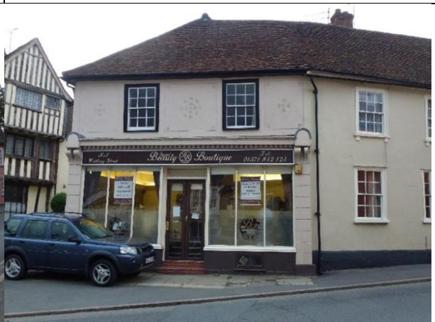
Above: No. 1