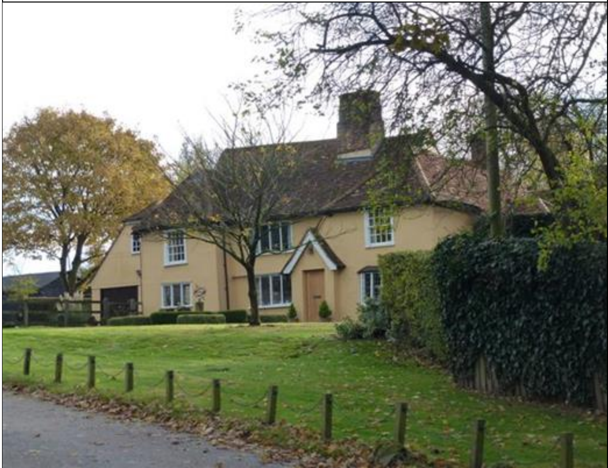
Above: Claypitts Farmhouse