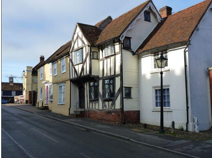
Left: North side