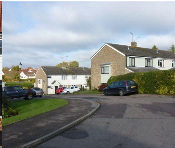
Above: St. Clement's