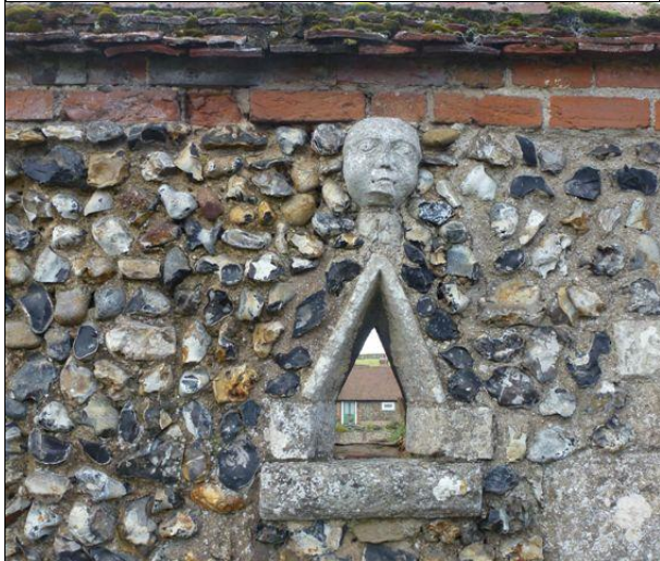
Above: Park Farm wall