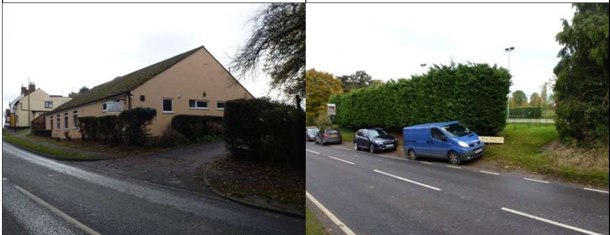
Above: The disabled centre