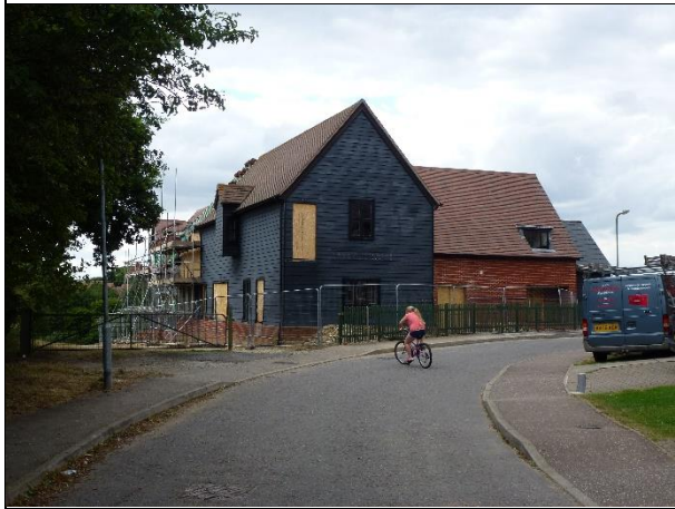
Above: Former barn babies