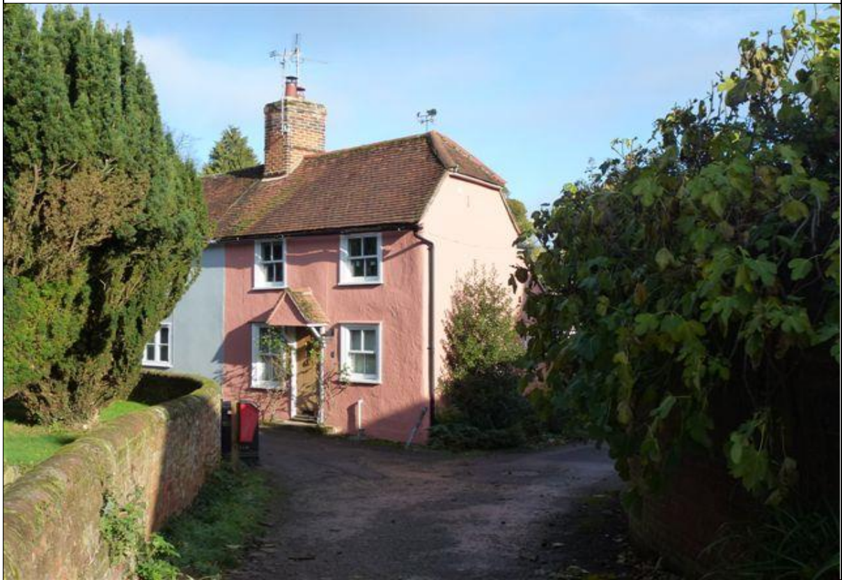
Above: A picturesque corner