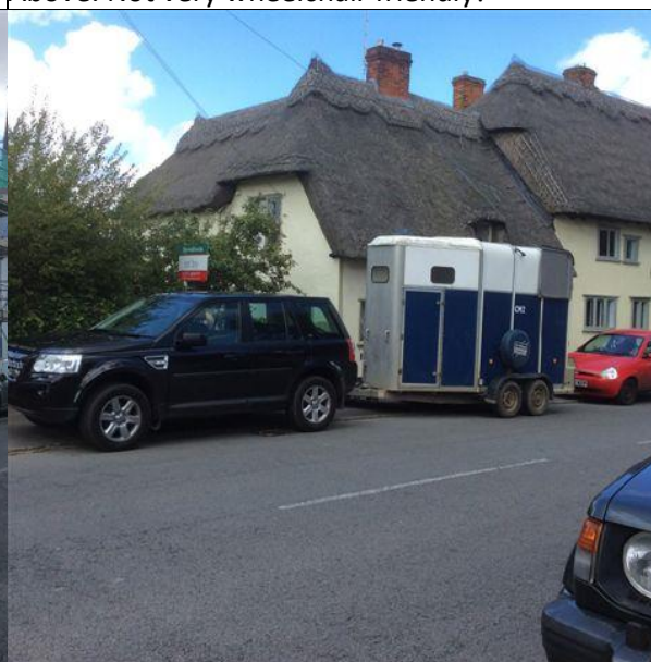
Above and above right: The prettiest street in England? ... If you could see it!