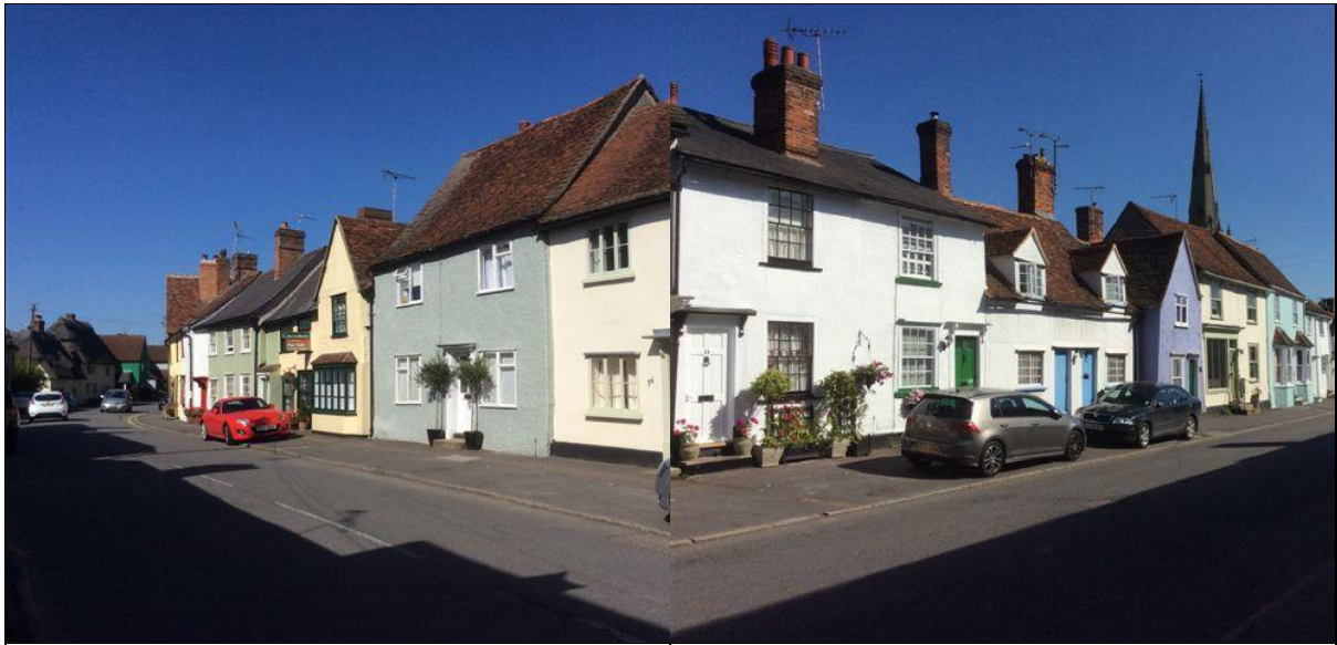
Above: East side