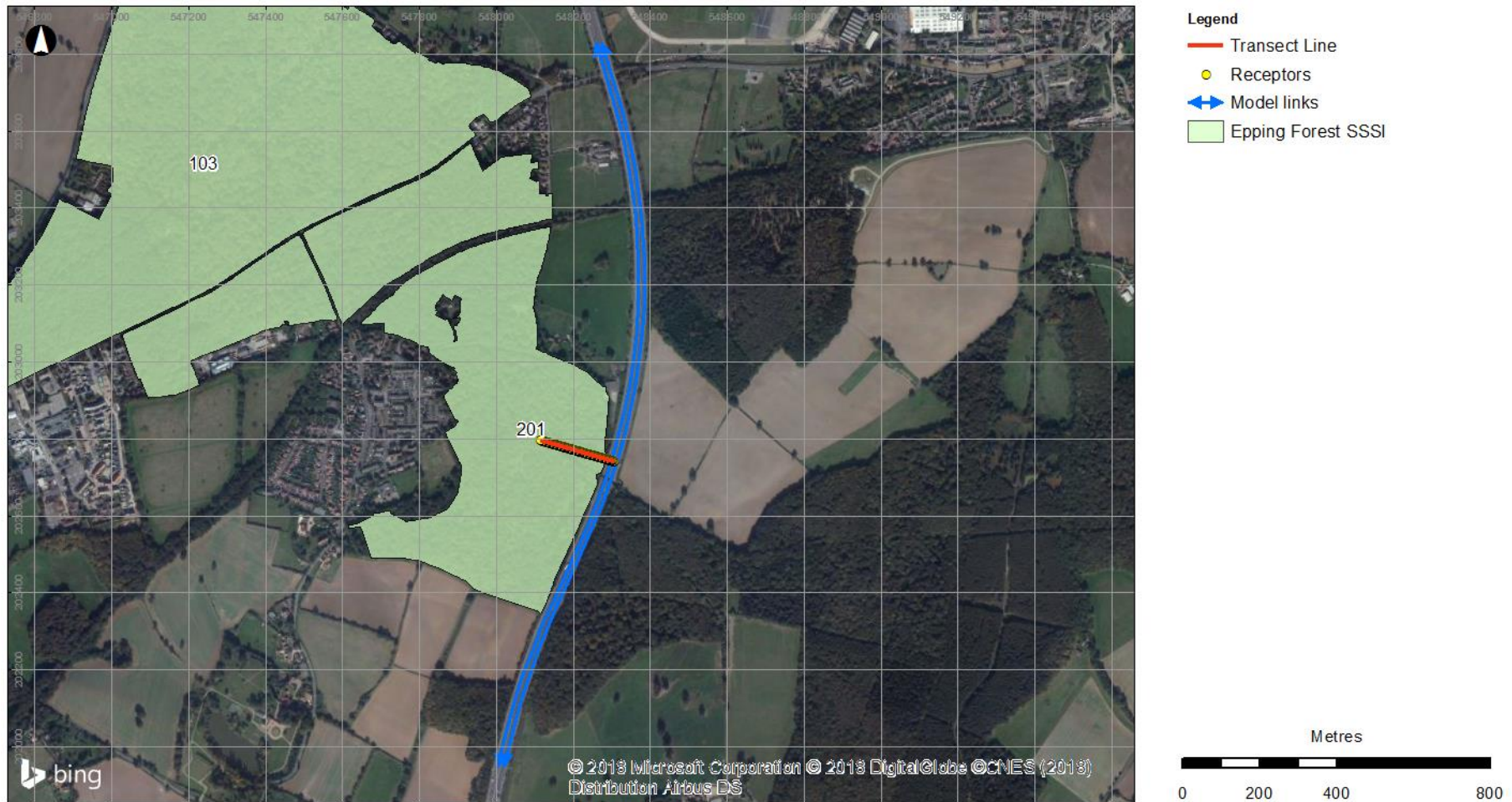
Figure 2: Road links and transect